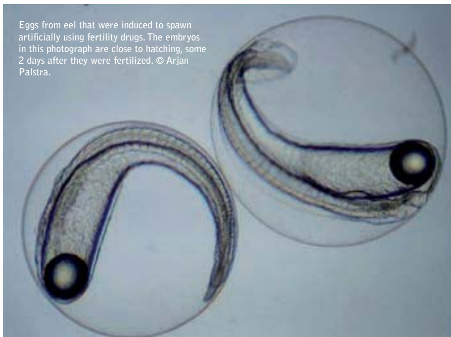
Eggs from eel that were induced to spawn artificially using fertility drugs. The embryos in this photograph are close to hatching, some 2 days after they were fertilized.

At a larger scale, the complex life cycle of the eel, with its long-distance migration to remote spawning areas, may well be affected (if not already) by climate change and shifts in oceanic currents. Such shifts could have dramatic effects on the ability of eels to make their way back to their