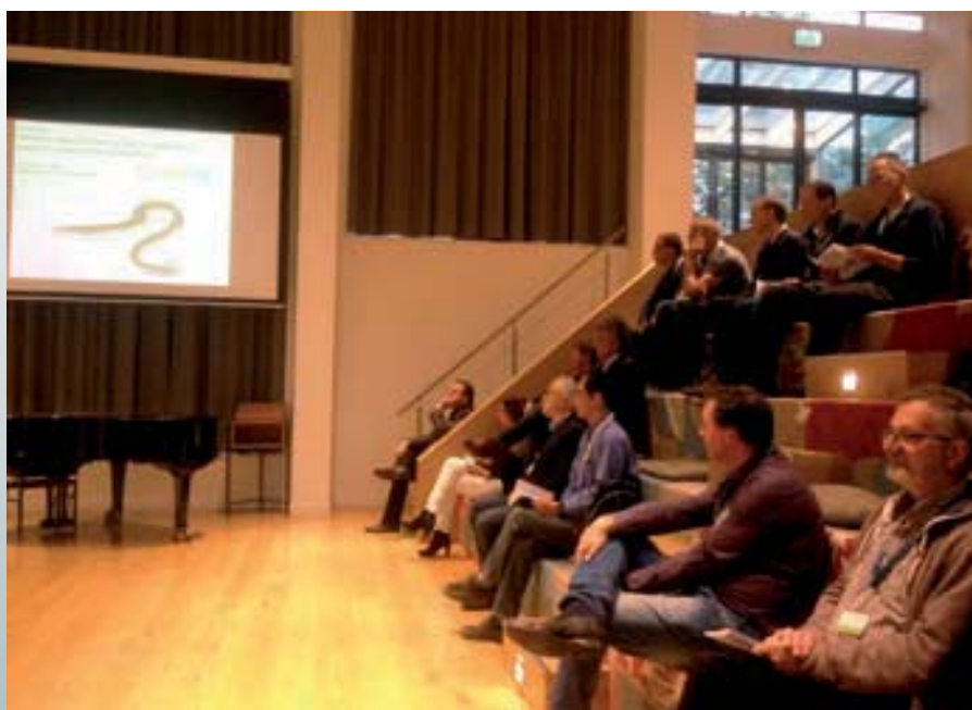
Presentations on eel reproduction at the Impulse Speakers Corner – a neat, open space whose ambiance is to help generate ideas. Wageningen University & Research.

A group of scientists in The Netherlands opted to get researchers, who run such 'eel fertility clinics', together from all over the world. The goal was ideally for each of them to present their state-of-the-art, and then work towards some sort of consortium, where the scientists could