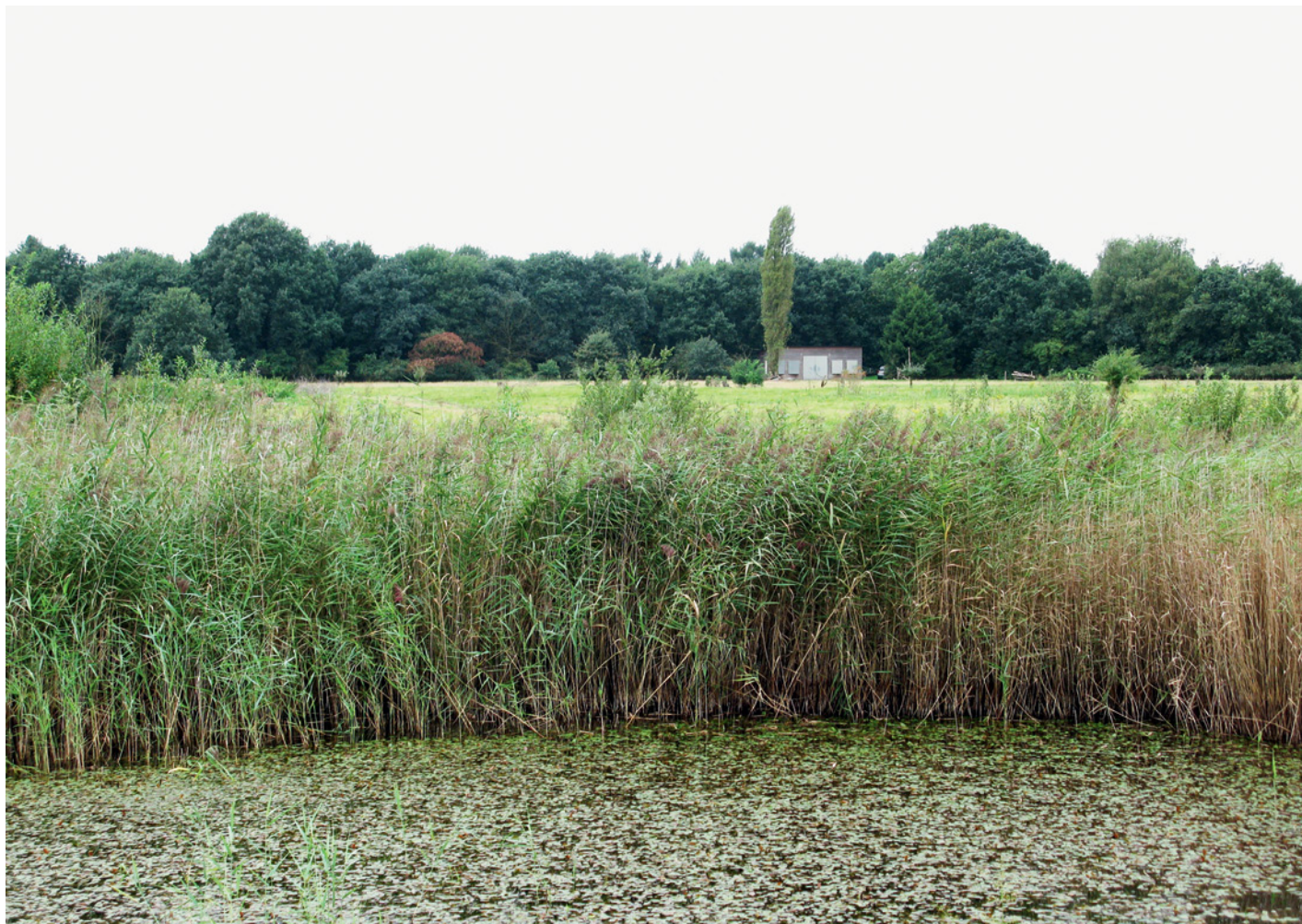
1. The study area in De Kaaistoep as seen from the east. In front is a small artificial pool. The site of the light is in the middle, just before the building, about 300 m behind the pool. In the background is a row of pedunculate oaks and other deciduous trees.

1. Het onderzochte gebied in De Kaaistoep gezien vanuit het oosten. Vooraan een gegraven poel met ongeveer 300 meter daarachter (in het midden) de plaats van het licht, vlak voor de veldwerkhut. Daarachter een rij met zomereiken en andere loofbomen.