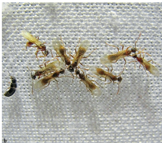
12. Different behaviour of ant species on the sheet. (a) Lasius umbratus females end at the highest point of the sheet or frame and then often fly away. (b) Myrmica ruginodis males gather at a spot on the sheet. 12. Verschillend gedrag van mierensoorten op het laken. (a) Vrouwtjes van Lasius umbratus (schaduwmier) gaan naar het allerhoogste punt van het laken of frame en vliegen dan vaak weg. (b) Mannetjes Myrmica ruginodis (bossteekmier) komen samen op een plaats ergens op het laken.

nocturnal activity of Rhopalocera. Geometridae and Noctuidae contributed 154 and 195 species, respectively, 55.2 and 53.3% of the Dutch species (Van Nieuwerkerken et al. 2010).