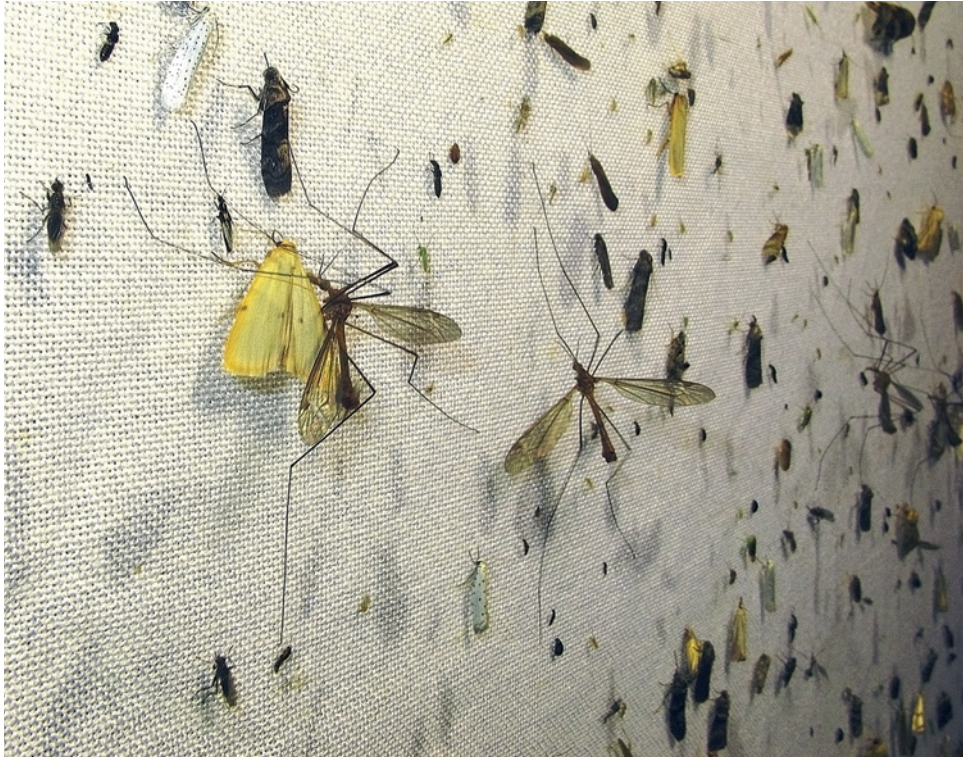
10. In the night of July 9th 2010, 00.20 a.m. (calm, 21 °C at midnight), about 2,000 moths and a lot of other insects like craneflies (Tipulidae) were present on the sheet. 10. In de nacht van 9 juli 2010, 00.20 uur (windstil, 21°C om middernacht) waren er op het laken ongeveer tweeduizend nachtvlinders en veel andere insecten aanwezig, waaronder langpootmuggen (Tipulidae).