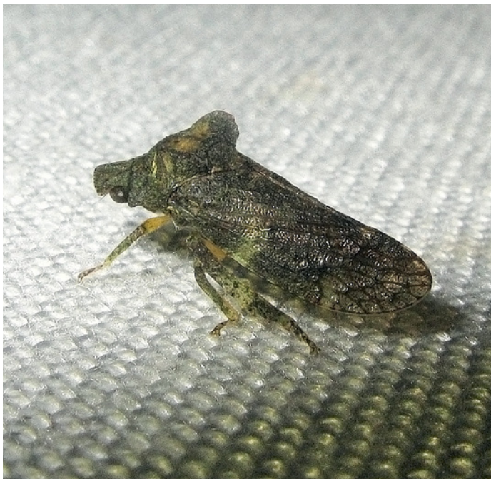
5. Horned leafhopper Ledra aurita (Auchenorrhyncha: Cicadellidae), a common species on the sheet from the end of July till the end of August.

and Lygus rugilipennis Poppius (all three Miridae), and Sigara scotti (Douglas & Scott) and S. striata (Linnaeus) (Corixidae), with 2,379, 1,191, 914, 889, and 820 specimens, respectively. In the night of April 26 th 2007 about 1,000 Miridae were counted, almost all Harpocera thoracica (Fallén). That night the temperature lowered from 20 to 16 °C, the wind was NE, force 3-4 but later calm, the sky was clear and the atmosphere became rather humid. Some nights many Corixidae were present, e.g., more than 1,000 Sigara spec. in the night of August 31 st 2008 (20 °C, little wind, sweltering, high atmospheric humidity, threatening thunderstorm). Corixidae had no grip on the vertical sheet and ended at the bottom sheet (figure 6). Some interesting species were discussed by Aukema & Hermes (2009) and Aukema (2011b).