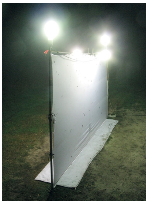
2. Four lamps of 500 W each light a vertical white polyester sheet of 1.9 × 3.5 m. Another white sheet is positioned on the ground.

1. Het onderzochte gebied in De Kaaistoep gezien vanuit het oosten. Vooraan een gegraven poel met ongeveer 300 meter daarachter (in het midden) de plaats van het licht, vlak voor de veldwerkhut. Daarachter een rij met zomereiken en andere loofbomen.