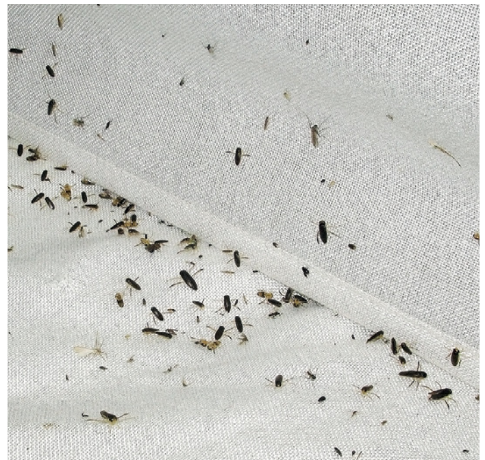
6. In the night of August 19th 2009 hundreds of small Corixidae (most of them Sigara spec.) were present. They could not hold on the vertical sheet and landed on the bottom sheet.

5. Oorcicade Ledra aurita (Auchenorrhyncha: Cicadellidae), algemeen op het laken van eind juli tot eind augustus.