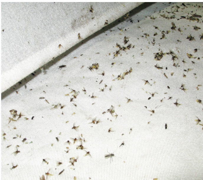
4. Ephemeroptera (mayflies) on the bottom sheet in the night of May 26th 2012, 10.30 p.m.

spinosa ), dog rose ( Rosa canina ), common snowberry ( Symphoricarpos albus ), blackberries ( Rubus ), Scots and European black pine ( Pinus sylvestris and P. nigra ), Norway spruce ( Picea abies ), European larch ( Larix decidua ), and others. To the east is open grassland on poor sandy soil, grazed by many rabbits. About 300 m to the east the grassland is bordered by another row of pedunculate oaks. About 600-700 m to the east a little canalized lowland brook flows: the Oude Leij. In 2005 and 2008 this brook was restored into a more or less natural condition. Between the Oude Leij and the light source five artificial pools are present, of which the largest has a surface area of about 1 ha. To the west and north of the light source are extensive areas of coniferous woodland (mainly Scots pine). The southern boundary is formed by the A58 motorway connecting Tilburg and Breda. A more detailed description of the site of research was published by Felix & Van Wielink (2008).