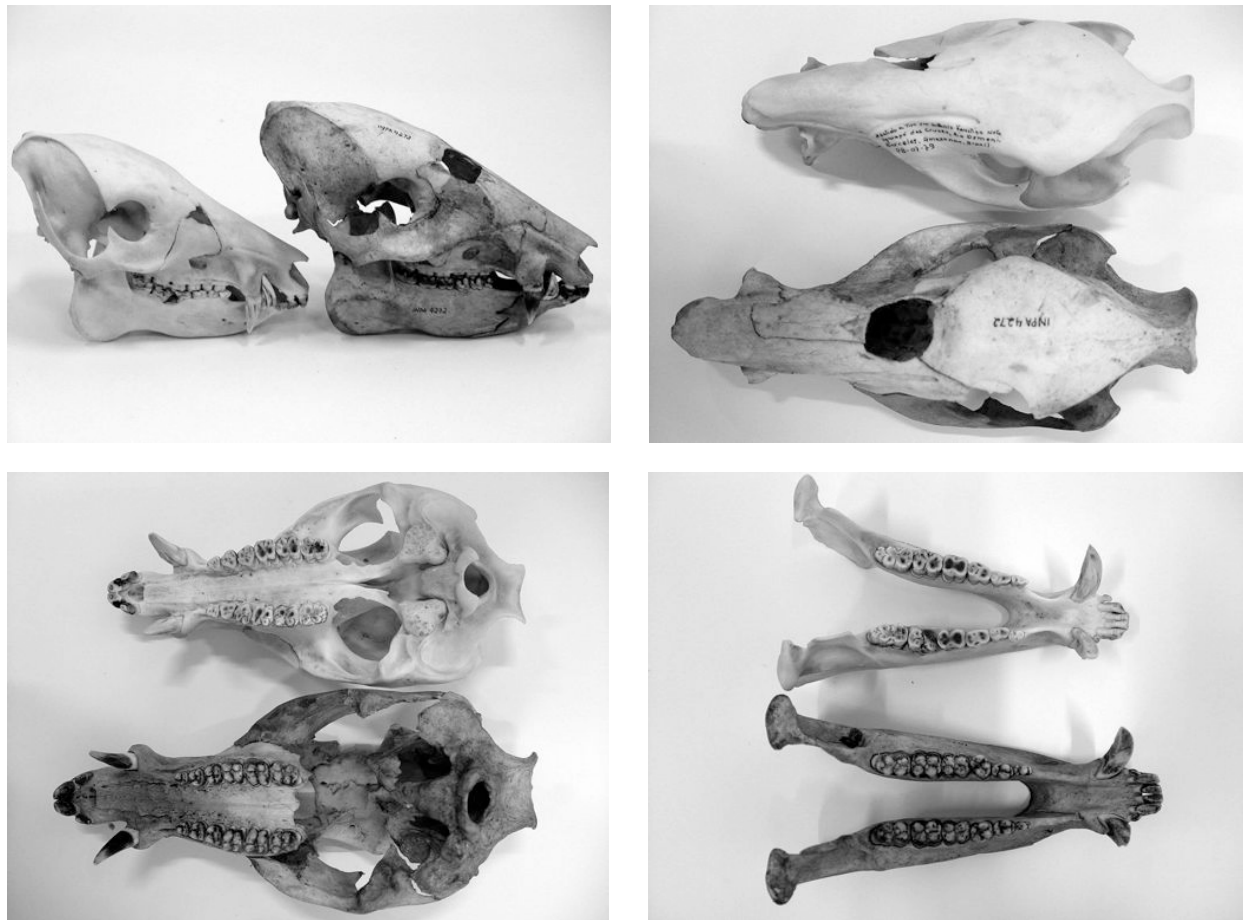
Fig. 3. a. Lateral view of the complete skulls of an adult male Pecari tajacu from Rio Demeni (INPA283) (left) and an adult male Pecari maximus from Rio Aripuanã (holotype INPA4272) (right). b. Dorsal view of the same skulls, Pecari tajacu (top), Pecari maximus (bottom). c. Ventral view of the crania of the same skulls (in same arrangement). d. Dorsal view of mandibles of the same skulls (in same arrangement).

MER & SOWLS 1993; GRUBB & GROVES 1993). Distinguished from Tayassu pecari , with which it is also sympatric, by its larger body size and weight (40–50 vs. 28 kg), and grizzled-brown thin fur instead of thick, long, evenly coloured blackish brown fur becoming grizzled or light-coloured only in the pectoral and inguinal regions. The forelimbs and legs are only distally black, while they are grizzled black and tan on the lateral and hind surfaces of the forelimbs in Tayassu pecari (GRUBB & GROVES 1993; MARCH 1993). In contrast to the general blackish brown body colour, the chin, cheeks and sides of the muzzle are white or yellowish-white in white-lipped peccaries. Distinguished from Catagonus wagneri , with which it is allopatric, by its larger body size and weight (40–50 vs. 29–38 kg), grizzled-brown thin fur with or without a faint dirty white collar instead of brownish-grey thick fur with a distinct bright white collar (WETZEL 1977; WRIGHT 1989; GRUBB & GROVES 1993).