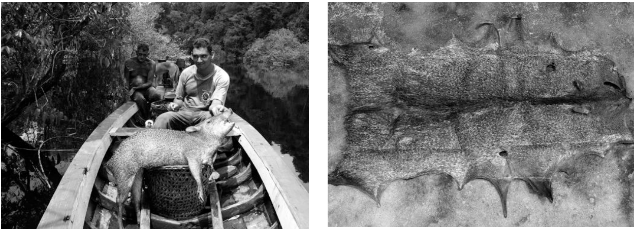
Fig. 2. a. (left) Hunters with freshly killed adult male specimen of Pecari maximus . The skull of this individual was saved and is here designated as the holotype (INPA4272).; b. (right) Skin of Pecari maximus paratype specimen MR315, lacking even a faint collar.

bigger than that of Pecari tajacu . Most of the body thinly bristle-haired, overall colour brown mixed with dirty white, a black mid-dorsal mane running from between the ears as far as the rudimentary tail. Ears small and whitish at distal surface. Nasal disc pinkish, relatively small and soft. Collar running over the shoulders very faint, dirty white, or absent (Figs. 1 and 2). Whitish, thinly haired circum-ocular rings (Fig. 1). Distinguished from all other peccary species by its larger size; thin fur; proportionally longer legs giving it a more gracious general appearance; proportionally smaller head - skull length one fifth of total body length in Pecari maximus , one quarter in Pecari tajacu and Tayassu pecari (WOODBURNE 1968), and