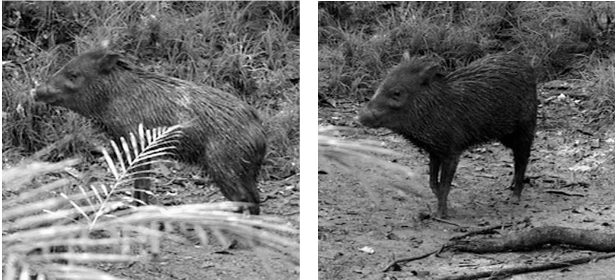
Fig. 1. Wild giant peccary Pecari maximus sp. nov. visiting a pond in the middle of continuous high rain forest; a. and b. show two different adult individuals belonging to the same family of four giant peccaries.