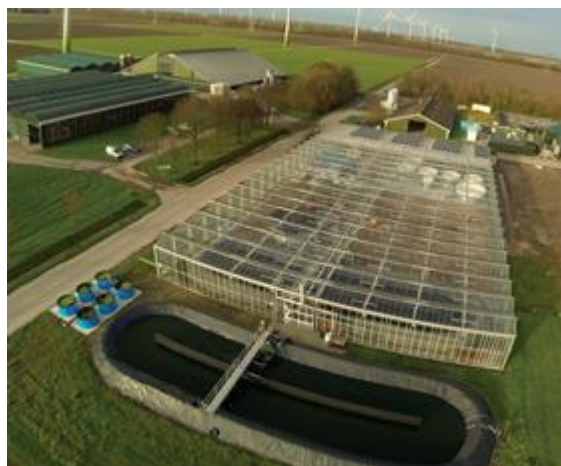
Figure 3: Aerial photo of ACRRES site in Lelystad, the Netherlands

In order to research and test new production methods, nutrient recycling and soil quality issues, the pilot project currently comprises: