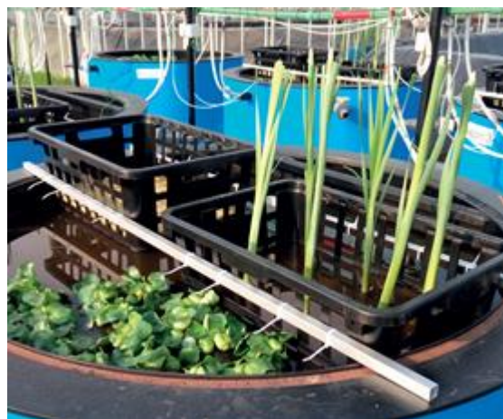
Figure 4: System with aquatic plants growing on the diluted fraction of biogas slurry

At the ACRRES pilot site, the algae culturing and harvesting technology of the company Algae Food & Fuel (AF&F) (5) is being tested. The raceway ponds are used to grow algae fed by minerals from biogas slurry or artificial fertilisers and CO 2 from the flue gases of the nearby digester and the CHP engine. The growth rate of algae is further increased by using excess heat from the CHP engine to support algae productivity. The algae are harvested three to five times a week year round. The temperature, optical density, nutrient content, algae biomass and species composition are monitored. At present, the algae biomass produced is mostly used for high value feed applications (feed additive). The algae production site of ACRRES was one of the pilots in the Interreg project Energetic Algae (Enalgae) (6). Within that project a bio economic model in Excel is being developed based on the open algae ponds built at ACRRES, Lelystad [7].