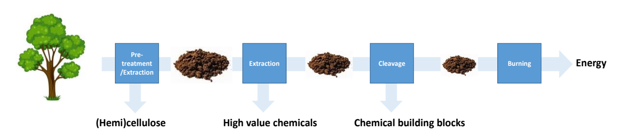
Figure 4. A cascade based lignin valorisation strategy.

The structural complexity and general recalcitrance of lignin could then be addressed by the cascade approach to lignin valorisation, entailing a depolymerisation process that consists of several stages. A first, highly selective step could extract targeted and isolatable high-value chemicals out of the lignin. Even if the yields and efficiency are low for this step, the high value of the products would still make such a process economically feasible. The lignin left after extraction/isolation of these high-value compounds would be more condensed than the starting material, and can be subjected to subsequent harsher cleavage steps, which focus on cleaving more recalcitrant bonds. Any heavy residues left after such a severe treatment could then in turn for example be cracked for use as fuel, used for the applications the asphaltene fraction of crude oil is used for today or still burnt for the generation of heat and power, making full use of the complete lignin input for various process streams.