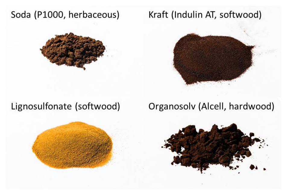
Figure 3. Photographs showing the differences in physical appearance for a number of typical technical lignins.