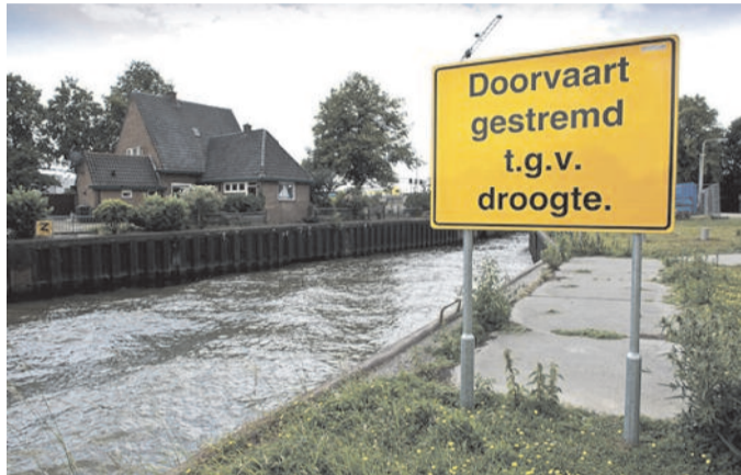
Due to lack of fresh water, canals are temporarily closed for traffic.

Due to climate change, the demand for fresh water is a growing issue worldwide. To forestall a shortage of clean water and to simultaneously adapt to climate change, the Delfland Water Authority has set goals to minimize water pollution and close loops for energy, raw materials and water in order to minimize both negative impacts on the (local) environment and (increased) dependency on outside sources.