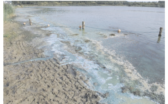
Lack of input of fresh water promotes stagnant water and is favorable to toxic algae like the cyanobacteria.