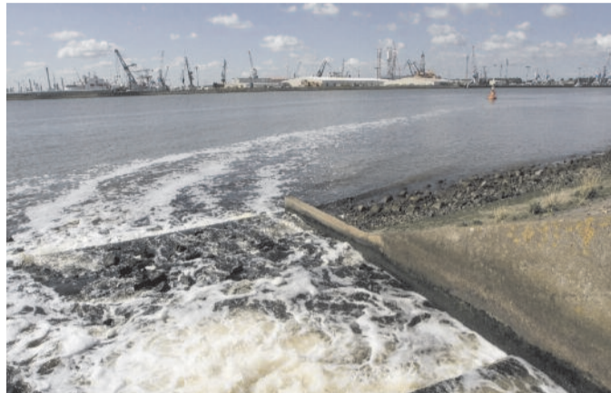
Currently fresh water from the wastewater treatment plant is discharged into the sea.