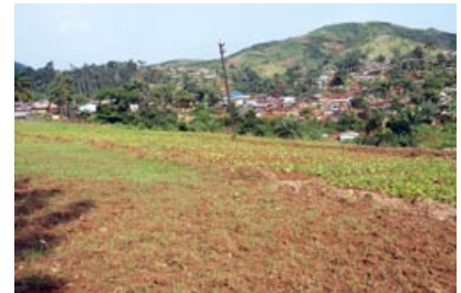
Photo: Site in Kamituga where BANRO SPRL (a private mining company) is in the exploration phase

N2Africa partnered with Women for Women in Kamituga (South Kivu, DRC). Together they offer the women from this region better opportunities in ‘business’ agriculture than they currently get from heavy work in the mines.