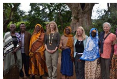
Photo: N2Africa farmers at Sanya Station Village, Hai District with the foundation officers