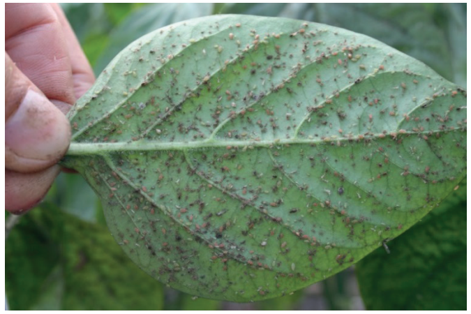
Figure 4. Peach aphids on sweet pepper infected by P. neoaphidis .

7. Study the interaction between entomophthorales and their role in causing natural epizootics. Natural epizootics in aphid population in organic greenhouse in The Netherlands were often caused by a mix of two entomophthoralean species: P. neoaphidis and Entomophthora planchoniana . Little is known about their interaction and how that affects their efficacy in aphid infection.