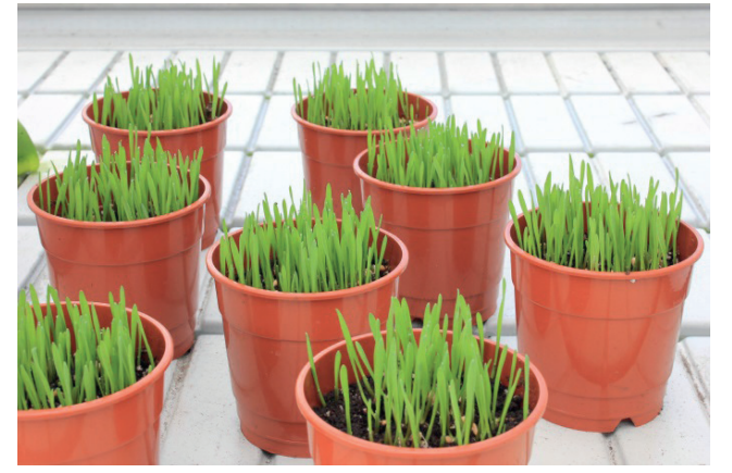
Figure 1. Banker plants - wheat seedlings infested with Sitobion avenae.