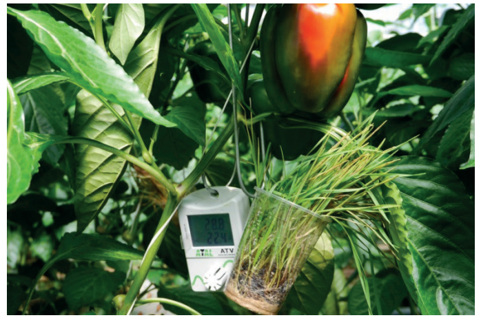
Figure 3. Small banker plant with grain aphids infected by P. neoaphidis.

Banker plants infested with infected cereal aphids need to be transferred into greenhouse. They can be hanged in positions which allow fungal spores to reach crop pests (Figure 3). Relative humidity should be kept at high level in the greenhouse for the next two nights (or at least 6 hours). Once infected, winged (alate) aphids from the crop can spread the infection.