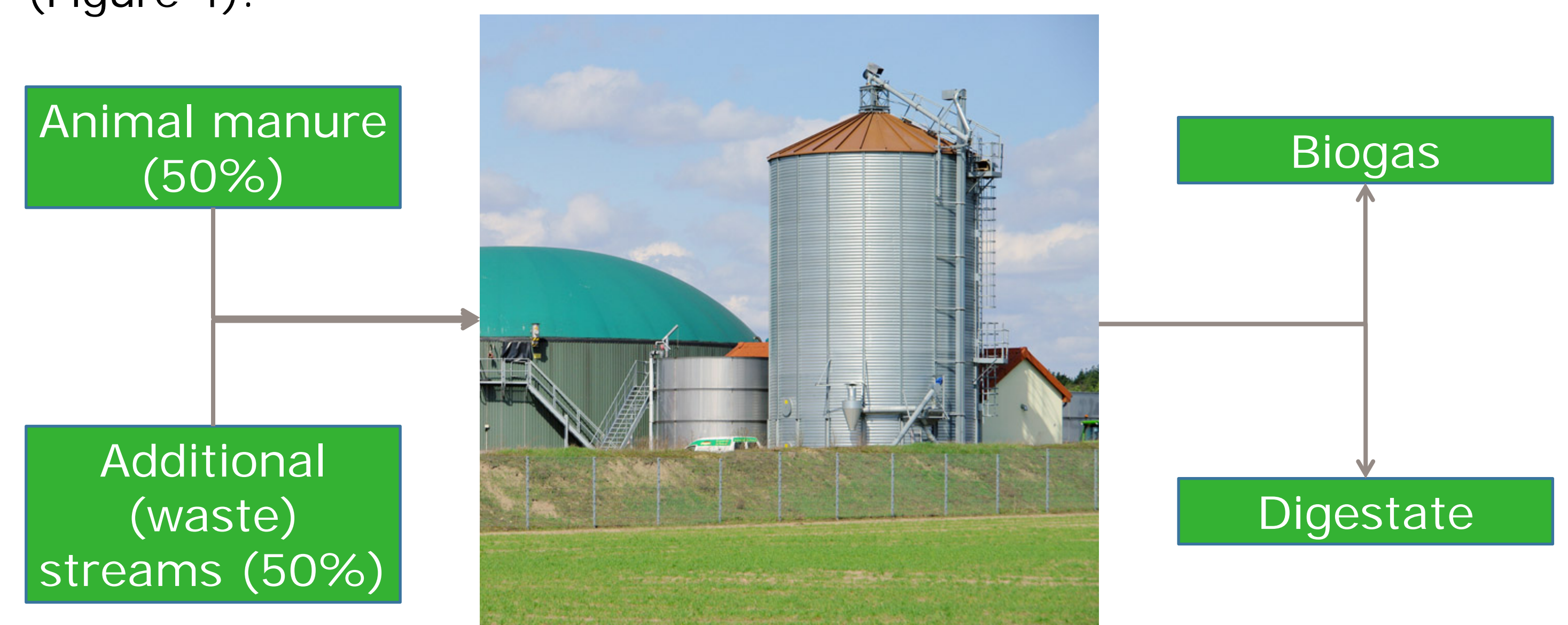
Figure 4. Biogas production from manure and waste streams.

Biogas can be produced from animal manure and other waste streams (Figure 4).