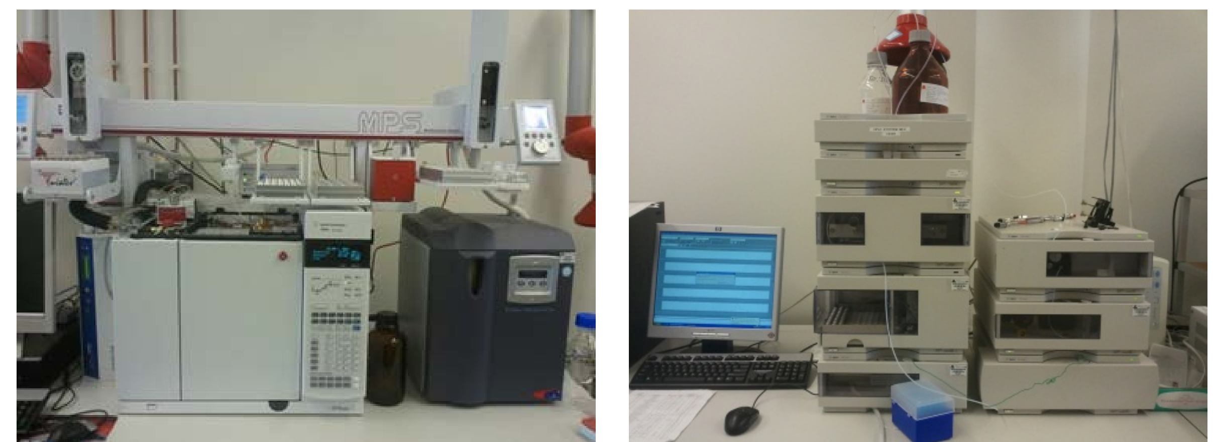
Figure 3. Equipment used in manure research: gas (left) and liquid (right) chromatography.

Together with the NVWA, RIKILT is active in uncovering any kind of fraud or irregularities. A wide range of analytical techniques (chemical, microbial and microscopic) is available to determine the authenticity of animal manure (Figure 3).