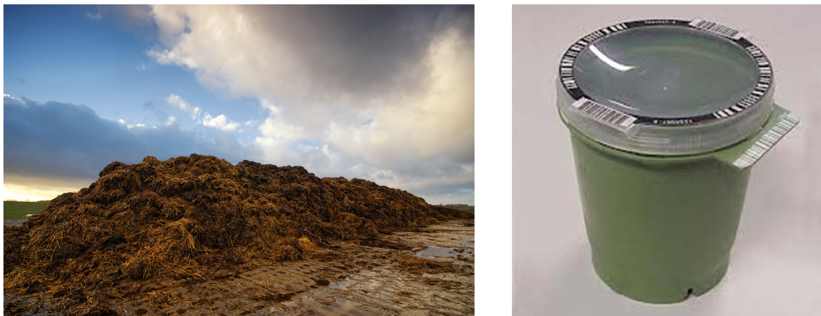
Figure 1. A heap of manure (left) and a typical sample container (right).

From a heap or transport of manure a sample is taken (Figure 1).