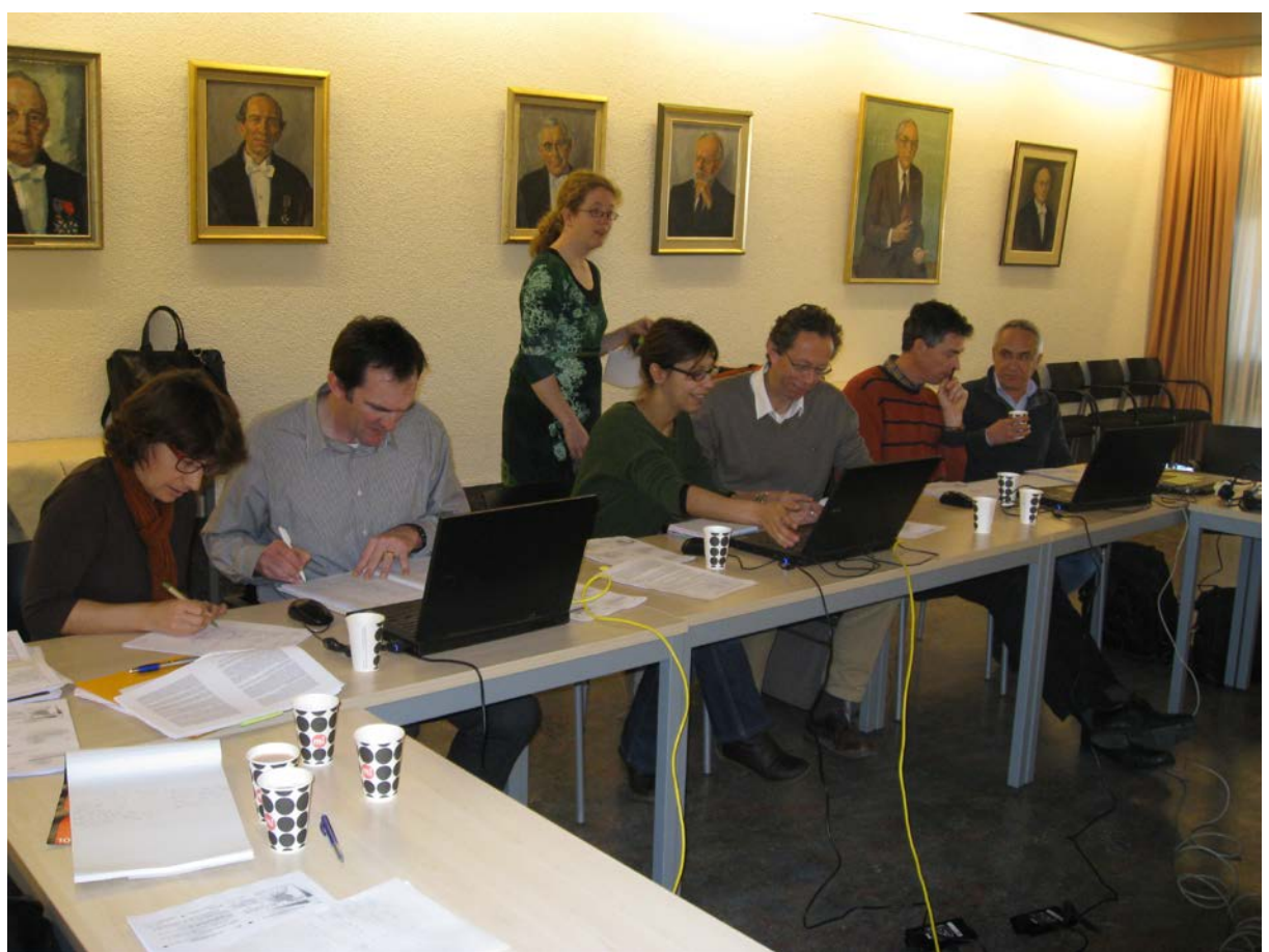
Figure 3: A ROC+ session

The ROC+ method has been successfully applied within a number of projects, including the Valerie [2] project. Comments van domain experts indicate that they are positive about the process, even regarding it as a form of teambuilding.