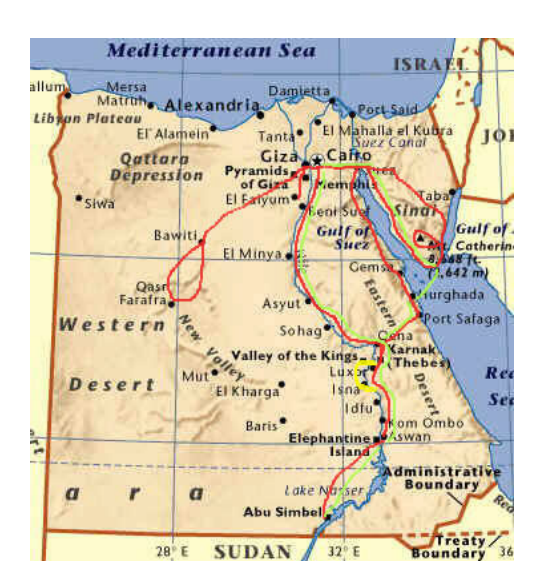
Figure 2.1 Egypt

Egypt is an independent republic with a democratic government. Within the Arab world, it is the most populous country and has second largest economy. It is neighboured by Sudan, Israel and Libya.