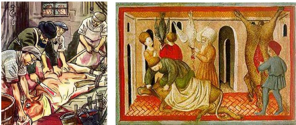
Figure 1. (left) A drawing of the Jewish Ritual, slaughter of a cow; (right) Drawing of ritual slaughter of the Jews in the 15 th century 11

Jewish and Islamic slaughterers use a sharp knife to cut the throats of animals in order for those animals to bleed out entirely. For the ritual slaughter of Muslim food, the slaughterer must be a Muslim. Regarding Jews, the slaughterer must be accredited by the Jewish authority.