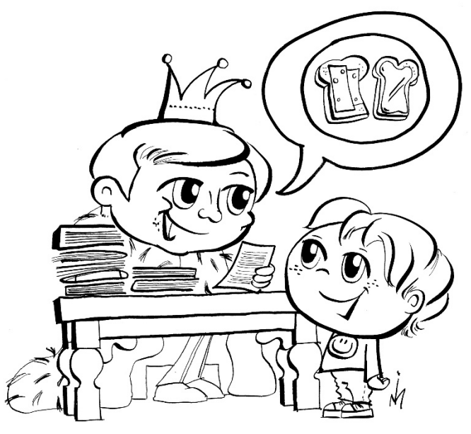
Figure 1: Breakfast like a king<sup>1</sup>

Breakfast, the first meal of the day, is often mentioned as the most important meal of the day. A well-known old adage is: "Breakfast like a king, lunch like a prince, and dine like a pauper". Is there wisdom in this old saying?