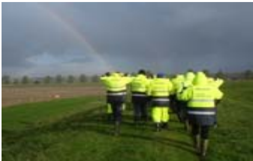
Volunteers monitor the dyke

Preference for public, private or mixed depends on political color.