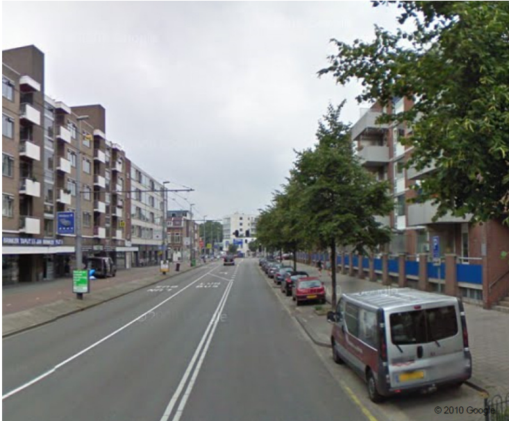
Photograph of J.P. van Muijlwijkstraat in Arnhem

The measurement campaign in the J.P. van Muijlwijkstraat in Arnhem is conducted as part of the cooperation between the projects “Future Cities” and “Climate Proof Cities”. The measurements consist of the following components: