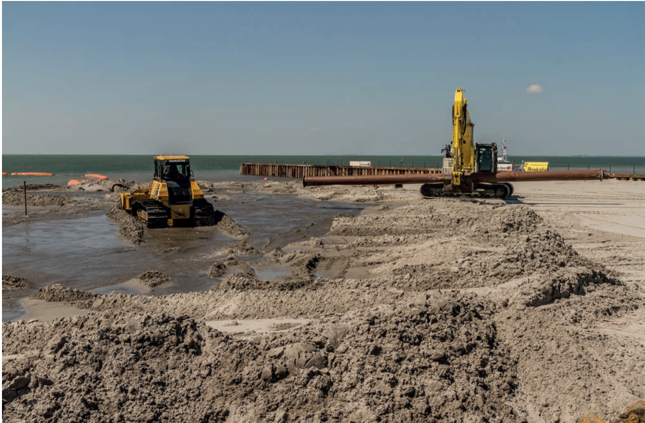
Figure 2: Work in progress