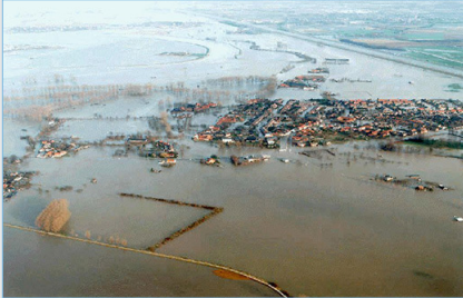
River Maas 1995