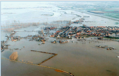
River Maas 1995