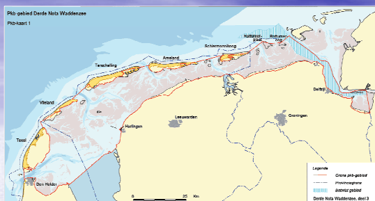
Dutch Wadden Sea

Alterra, Wageningen University and Research Institute, The Netherlands