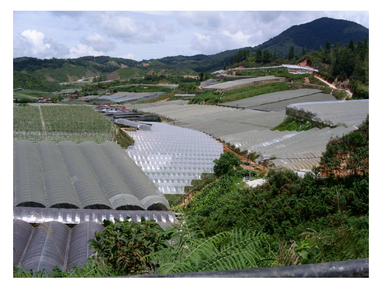
Figure 15. Various types of plastic houses in the Cameron Highlands, Malaysia.