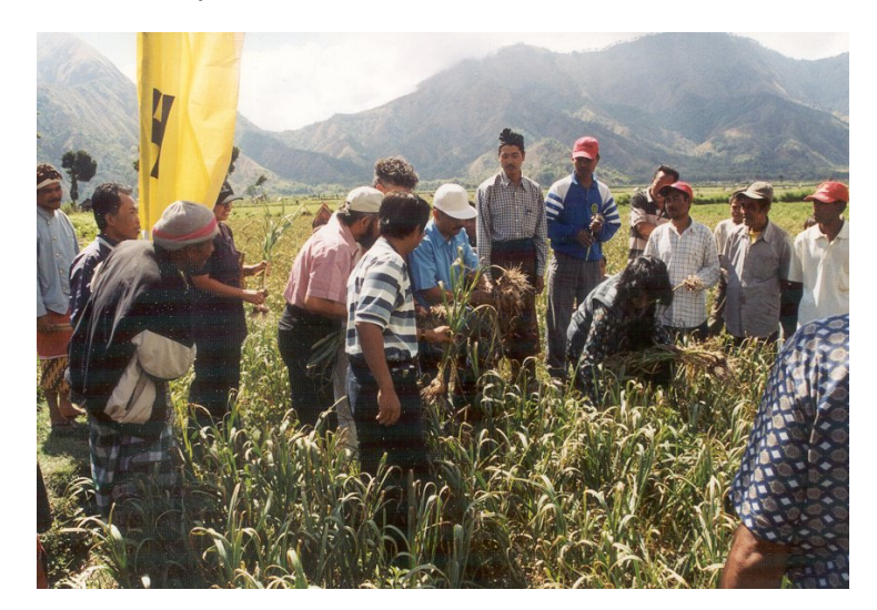
Figure 3. Festive start of the garlic harvest on Lombok.

<u>Highlight</u>: The identification of garlic accessions that have good flowering potential and virus resistance. <u>Conclusion</u>: Project runs satisfactorily now.