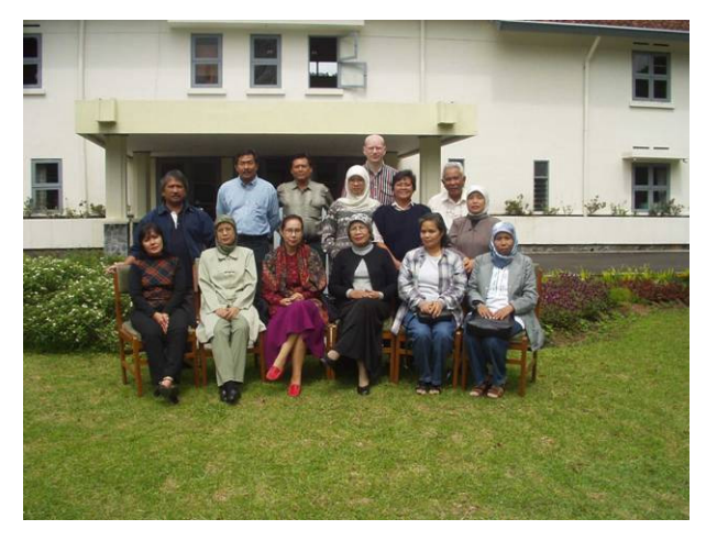
Figure 18. Participants of the Quality Assurance and Food Safety Course.