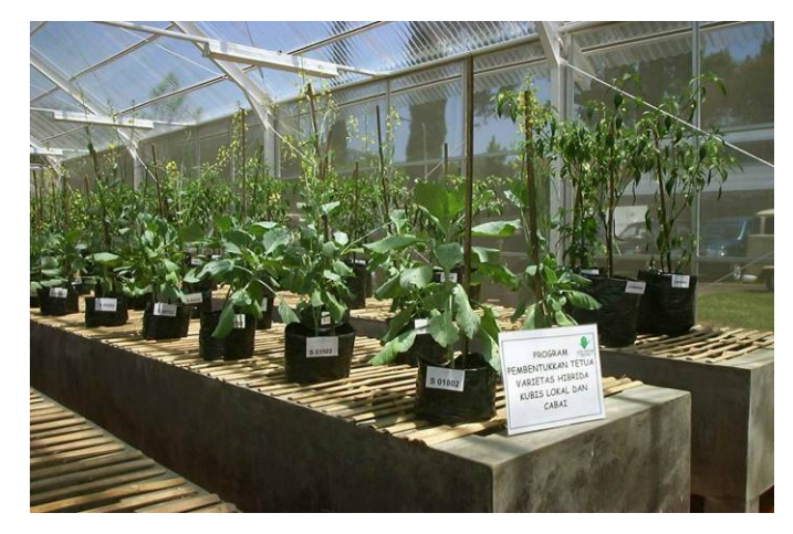
Figure 10. Cabbage and hot pepper for pollen and seed production.