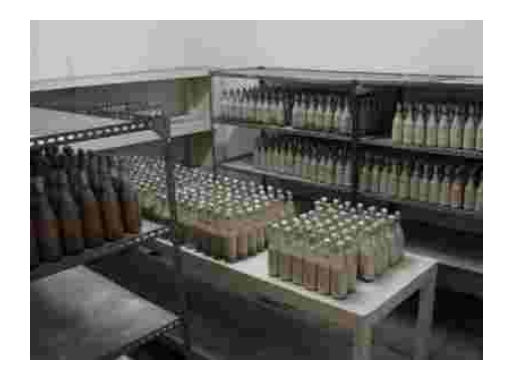
Figure 4. Spawn production at the Institute of Horticultural Seed development and Agribusiness promotion in Yogyakarta.

<u>Highlight:</u> The first trials for oyster mushroom testing have started at IVEGRI. Conclusion: The project is running well.