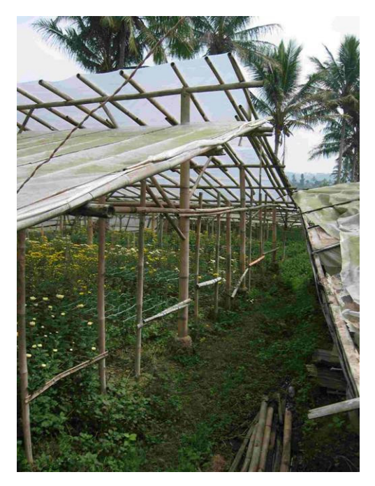
Figure 14. Plastic house of a small flower grower.