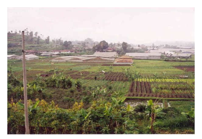
Figure 6. Protected cultivation in the highlands.