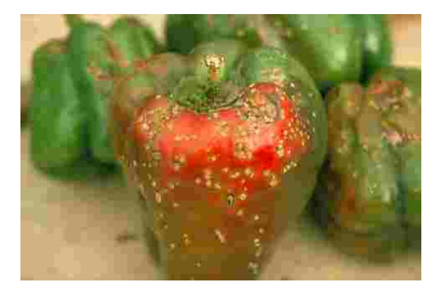
Figure 19. Bacterial spot on sweet pepper.

The results of the survey will be published on internet (webpage HORTIN-programme).