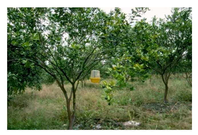
Figure 8. Fly trap in citrus orchard on Kundur Island.