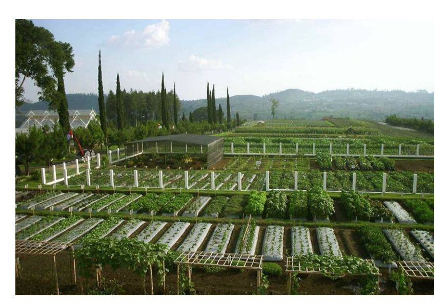
Figure 2. Excellently organised fields for the Ekspose 2003 at IVEGRI.

The aim of training most counterparts in the Netherlands has largely failed due to the too short notice for several of the funding sources, and because of the very late release of funds from the Indonesian side. On the other hand, almost all project leaders visited the counterpart institutes and had ample time to discuss problems and possible solutions. Inventories of essential equipment lacking were made. Many small supplies have been bought with Indonesian and Dutch money, but for the more expensive pieces of equipment, solutions still have to be found. Institute staff benefited largely from the training activities at their institutes, in which they took actively part. Not only the participation, but also the preparation of such events has many learning elements.