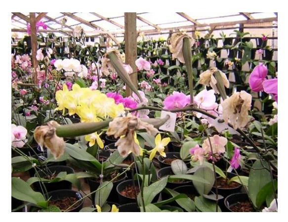
Figure 9. Orchids are among the first to get a collection protocol.

The visits to growers showed that the production of tropical ornamentals is an important economical activity in West Java. The growers produce for the local market of West Java (including Jakarta), for different islands of Indonesia and for export abroad. The ornamental growers indicated that a good income could be achieved and the large-scale growers employ many persons. The visits also showed that the growers use and need different sources of ornamental diversity. This implicates that a well-organised acquisition and germplasm maintenance program of IOPRI can have impact on the economy of this region in West Java.