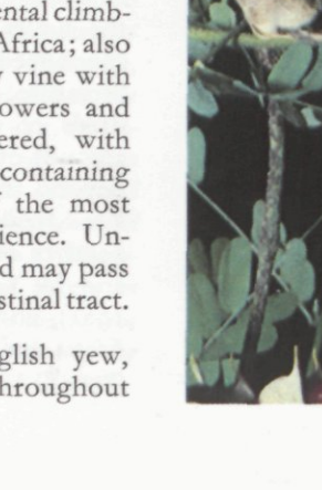
Fig. 4. Taxus baccata (English yew, yew). Wild and cultivated throughout

Fig. 3. Abrus precatorius (rosary pea, crab's-eye, precatory bean, jequirity bean). Cultivated as an ornamental climber in warm climates; wild in Africa; also met with as a weed. A woody vine with blue-purple papilionaceous flowers and feathered leaves. Pods clustered, with seeds bright red and black, containing abrin (a phytotoxin), one of the most potent poisons known to science. Unbroken seeds less dangerous and may pass without harm through the intestinal tract.