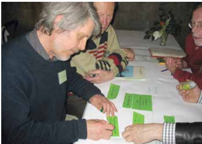
Green Idea Cafe.

Analytical framework for the relationship between sent information about ecosystem services and the behavioural response of receivers in a landscape planning context. Intervening factors are supposed to interact with the framed information about ecosystem services and filter and transform the information. This may eventually result in one or several behavioural responses.