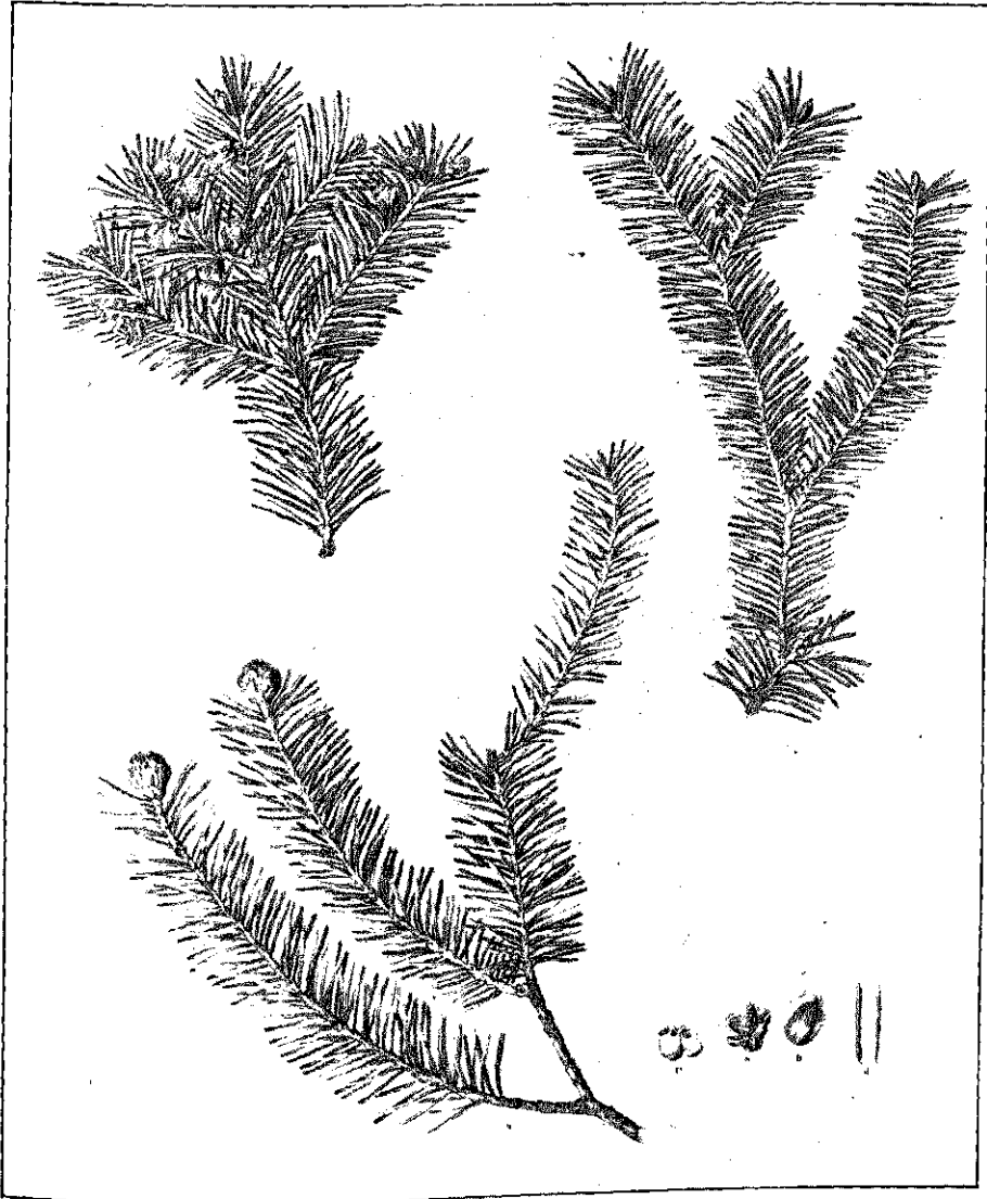
PINUS TAXIFOLIA IN LAMBERT „A DESCRIPTION OF THE GENUS PINUS” 1 E ED. I P. 27. TAB. XXXIII. D = TWO PETIOLED NEEDLES.