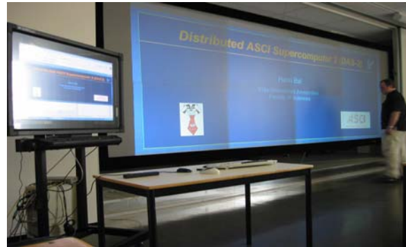
Fig 1: Setup of the ICWall with on the left a smart-board to control the wall from the room.

A CAVE is a full immersive display device using stereographic projection. The size of the CAVE is approximately 3X3m and can have projections on all six sides of the cube. The CAVE at Sara has projection on four sides of the cube excluding the back and the ceiling.