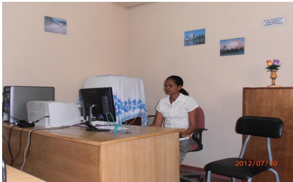
Fig 5.3 Woman graduates in accounting from HWPTVTC working in NGO

The pictures below show HWPTVTC women graduates involved in different tasks.