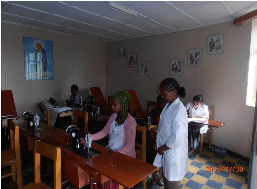
Fig 5.5 Embroidery by machine women graduates working in small enterprise

To make education effective for girls' and women's education, it is important to identify and overcome gender discriminations that spread gender inequality within the household sphere, the labor market, the community and state policies that hamper girls' and women's advancement in education. According to (Longwe, 1998), women's empowerment can be understood as a process whereby women individually and collectively increase their own self-reliance to assert their independent right, to make choices and to control resources. These will support in challenging and eliminating their subordination, and develop awareness of the existing discrimination and inequality between women and men and it's effect in their lives. It also deals with how power structures, processes and relationships produce and reinforce gender inequality. At the same time it indicates how to gain the self confidence, capacities and resources required challenging gender inequalities.