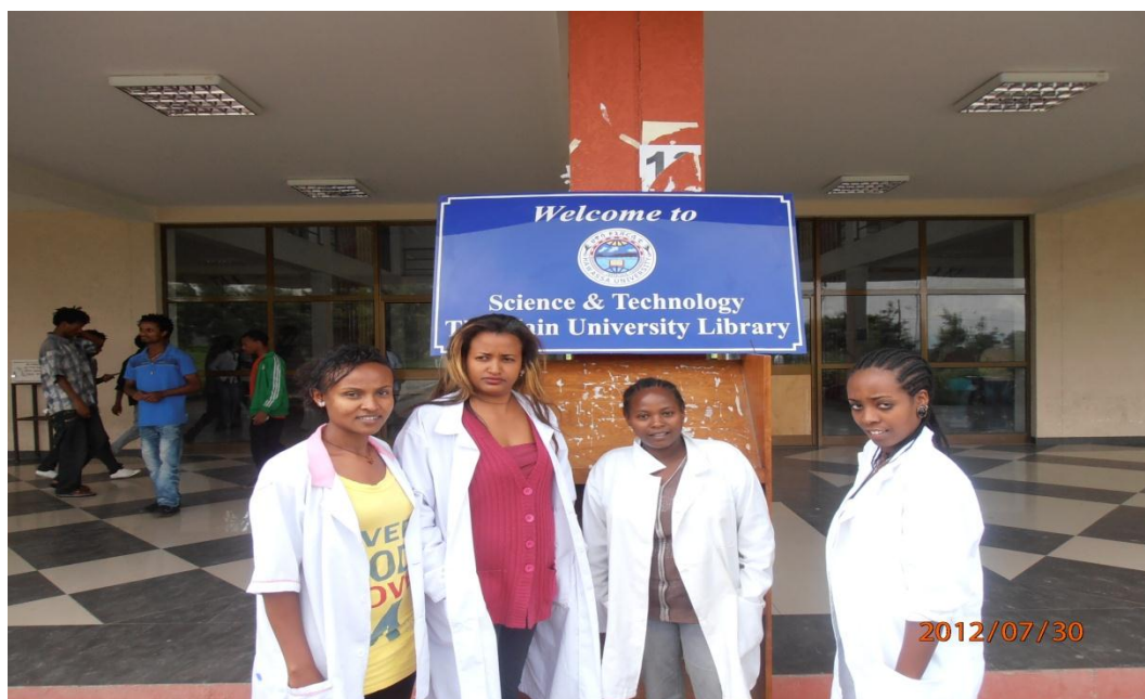
Fig 5.4 Women graduates in Library science from HWPTVTC working at Hawassa university library