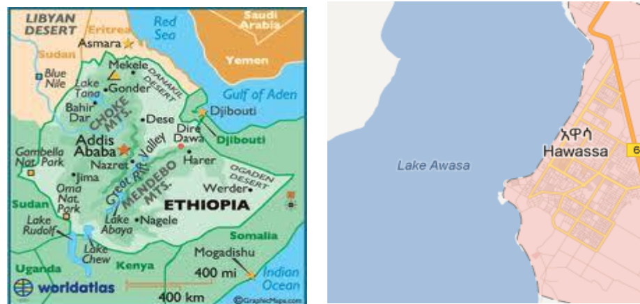
Fig.4.1 Map of Ethiopia and the study area

This city is home to Hawassa University (which includes an Agricultural College, a Main Campus and a Health Sciences College), many private and governmental TVET Colleges, Hawassa Adventist College, and a major market. The city is served by Hawassa Airport opened in 1988. Postal service is provided by a main branch; electricity and telephone service are also available. Important local attractions include the St. Gabriel Church and the Hawassa Kenema Stadium. Fishing is a major local industry. (Ethiopian demography and health survey, 2005)