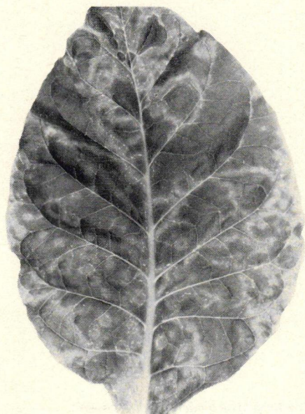
Fig. 3. Leaf of 'White Burley' tobacco plants with severe systemic ringspotting caused by tobacco ringspot virus.

However, a virus was transmitted in February 1968 when clarified and concentrated extracts of diseased plants of 'Lustige Witwe' were used. The leaves were ground in phosphate buffer solution containing 0.1% thioglycolic acid (w/w = 1/1)