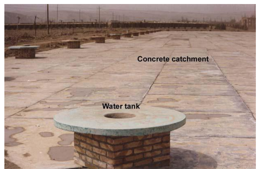
Water tank in Zambia.