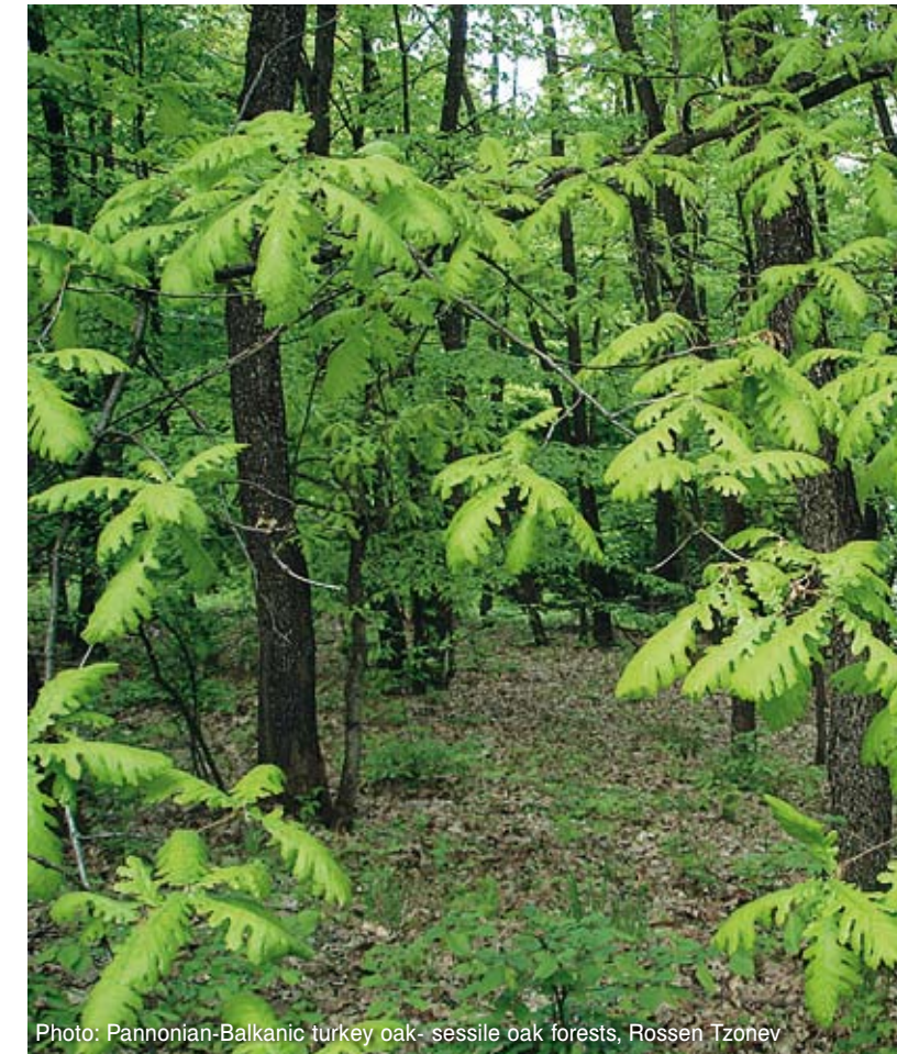
Photo: Pannonian-Balkan turkey oak- sessile oak forests, Rossen Tzonev

Trees and scrubs - Quercus frainetto , Q. cerris , Q. spp. , Fraxinus ornus , Pyrus pyraeaster , Acer spp. , Sorbus domestica , Carpinus orientalis , Crataegus monogyna , Ligustrum vulgare , Euonymus spp. , Cornus mas ; Herb layer – Brachypodium sylvaticum , Dactylis glomerata , Poa nemoralis , Festuca heterophylla , Melica uniflora , Geum urbanum , Luzula spp. , Clinopodium vulgare , Buglossoides purpureocaerulea , Fragaria spp. , Veronica chamaedrys , Veronica officinalis , Lychnis coronaria ,