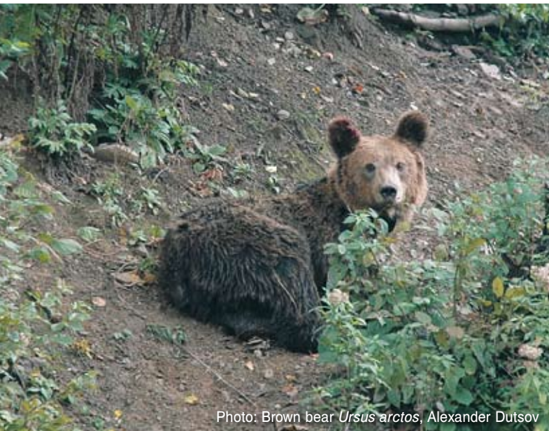
Photo: Brown bear Ursus arctos