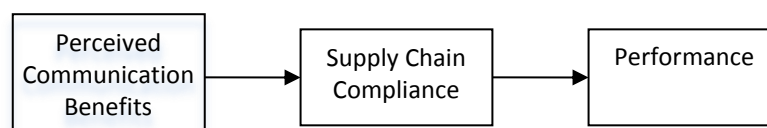
Figure 1. The research conceptual framework.

Figure 1 presents the research conceptual framework: