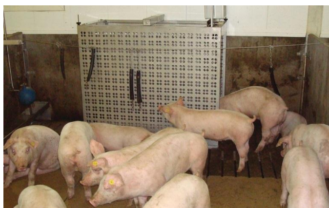
Figure 4: Impression fattening pigs