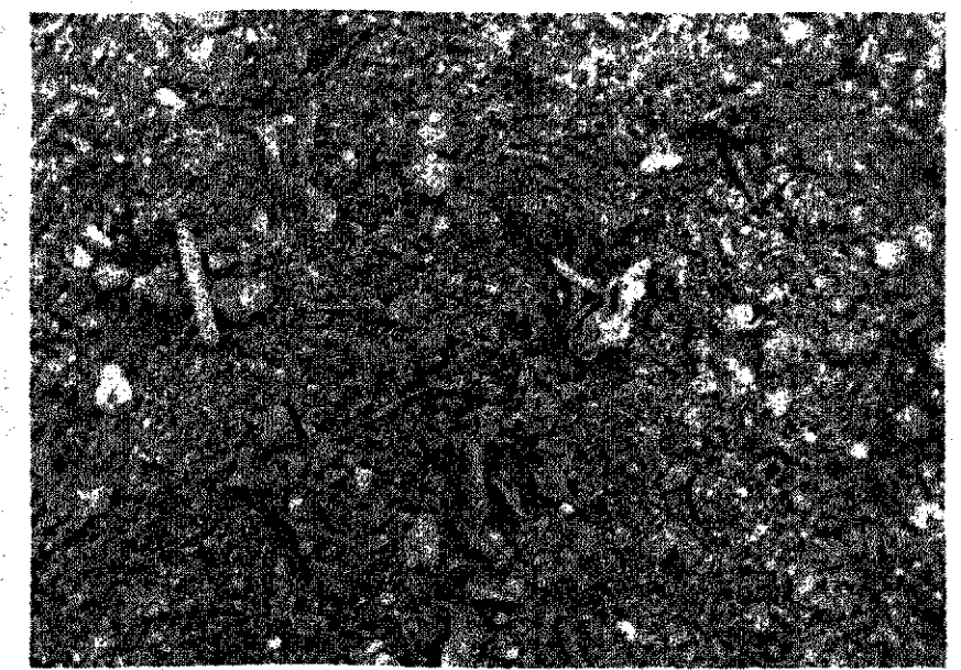
A mulch of town refuse compost has been spread as moist as possible and then sprayed. If used as coarsely as this it gives good protection to the underlying soil.