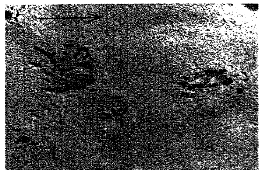
Sand blown over an artificial crust damages it and the soil underneath is blown out of the cracks.