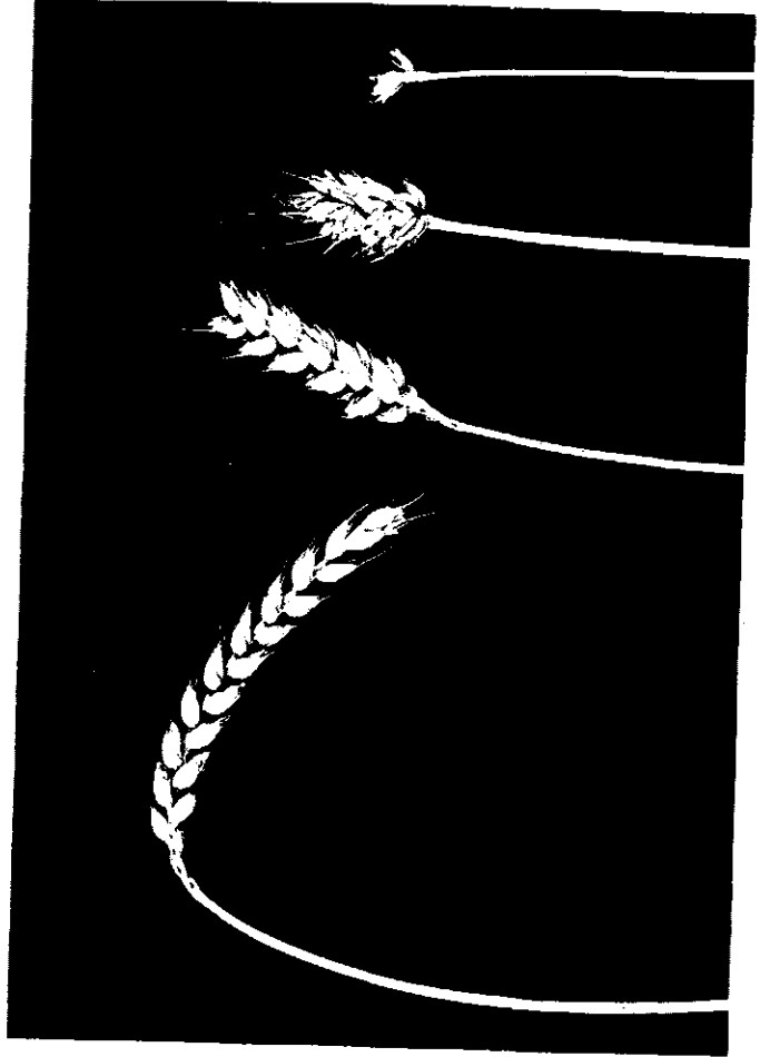
Plate 1. Normal (left) and malformed ears (others).