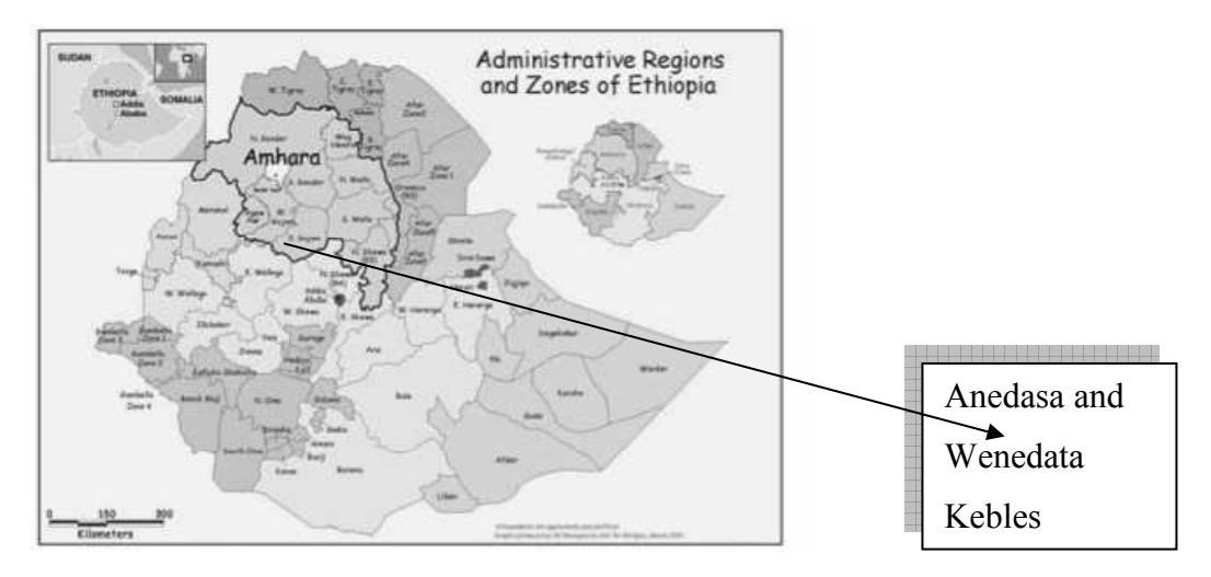
Fig.3 Map of Administrative Regions and Zones of Ethiopia (adapted from Berhanu Adenew and Fayera Abidi, 2005)