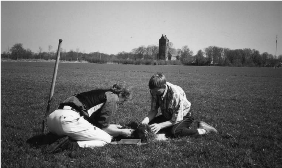
Farmers experimenting with soil fertility developed the 'cycle system' with improved nitrogen efficiency in plant, soil and animals.

solidarity among the local people was seen as a pre-condition to survival.