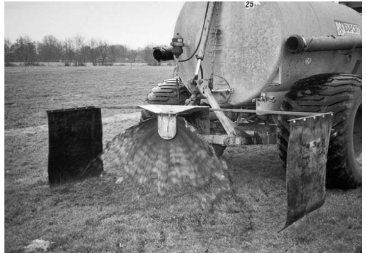
The improved cattle feed resulted in better quality manure which was spread on the soil by surface application. Special exemption from the government environmental regulations was required for this experiment.

There are several reasons that can explain the success of these environmental co-operatives in the North Friesian Woodlands. In the first place,