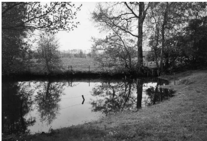
Typical landscape with ponds, hedgerows, belts of alder trees and grazing areas in the North Friesian Woodlands. The cooperatives invented new forms of nature and landscape management.

In 1992 two environmental co-operatives were founded: VEL (Vereniging Eastermar's Lânsdouwe) and VANLA (Vereniging Agrarisch Natuur- en Landschapsbeheer Achtkarspelen). The farmers started to develop their own answers to the problems. In addition to compliance with the ecological requirements, the aim was to ensure that as many families as possible could continue farming with a decent income. Creating a sense of belonging, unity and