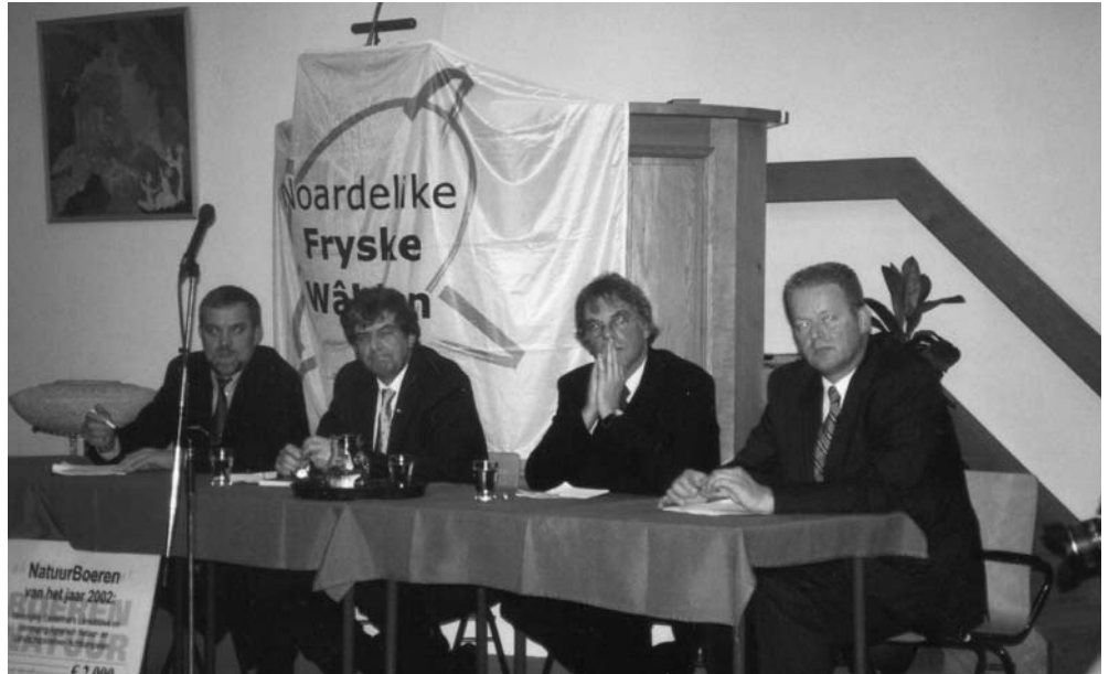
During a meeting of the VEL and VANLA co-operatives, new forms of agriculture are discussed with the Minister of Agriculture (2nd to the left), a scientist from Wageningen Agricultural University and a representative of the farmers' union (right).

What is crucial then is the 'intermediary circle': the network of institutions, actors and mechanisms that have allowed VEL and VANLA to find their own way forward. They have created an enabling environment for these initiatives. Several members of parliament have supported these farmers in defending and regaining the required political space. A group of researchers