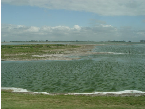
Figure 2 Semi-permanent flooding of agricultural land near Pehuajó