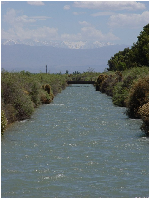
Figure 3 – Irrigation canal with water from Mendoza River

With only 800 km 2 , the Mendoza River basin has more than 800,000 inhabitants and contributes 68% of the provincial GDP, while 25% of its water is used for domestic and industrial purposes. The main crops grown in the irrigated areas are: grapes, fruit trees, olives, summer and winter vegetables and grass. The altitude of the area varies between 1200 and 570 m above mean sea level. In the higher parts, phreatic levels are relatively deep and in the lower parts they are shallow, resulting in water logging and salinization. The decentralized and participatory management model for the irrigation management, in force for more than 100 years, has still problems that affect water distribution, maintenance and, above all, water use control. The area's mean irrigation application efficiency is therefore poor, being 59%. Soil salinity is increasing in the areas with high groundwater tables. The recent construction of the Potrerillos dam in the Mendoza River will allow river regulation and scheduled delivery to users in the irrigation areas. Given this complex situation, an integrated study of the Mendoza River becomes mandatory in order to devise a proposal to supersede the current management model and the sustainability crisis that is bound to occur in the oasis. Figures 3 and 4 gives an impression of the area. Figure 5 shows the abandoned land due to an increase in soil salinity.