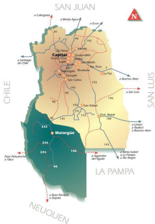
Figure 6 - Mendoza Province and the city of Malargüe situated 400 km to the south.

used in an irrigated area of about 2,700 hectares. As a result of the water use, the water level in the lagoon is slowly declining. Further threats are the exploitation of a number of oil extraction wells within the nature area.