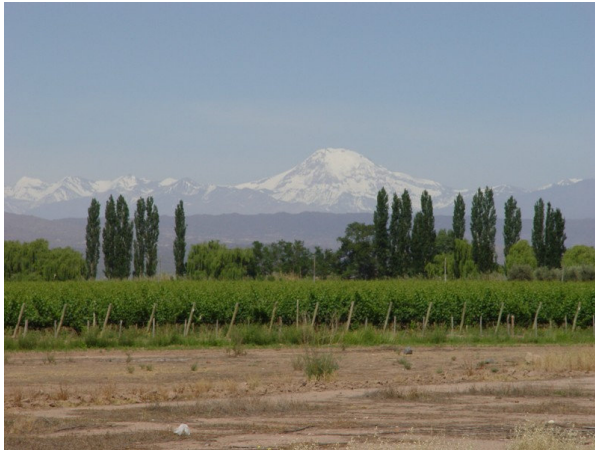
Figure 4 – Vineyards in the upper part of the area irrigated