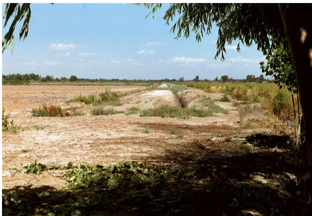
Figure 5 – Example of soil salinity in the area with high ground water levels