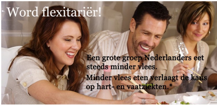
Figure 3 An example of the text/image combination