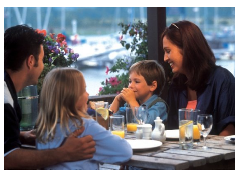
5. Happy family ontbijttafel