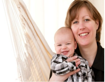
6. Moeder met baby