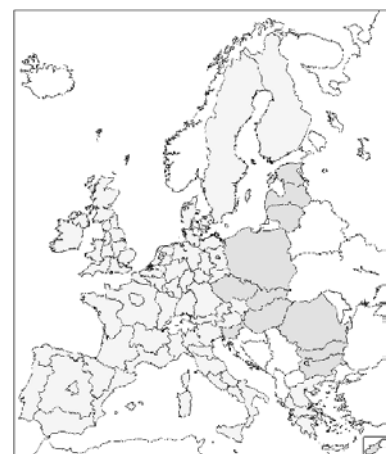
Figure 1: European Union NUTS 1 regions

In our work, a variety of data sources have been considered in order to collect the relevant data on livestock production, slaughtering and meat consumption. We adopted for our model the Level 1 Nomenclature of Territorial Units of Statistics (NUTS 1) (European Union, 2003), which divides the European Union in 97 regions (Fig. 1). Production and consumption data