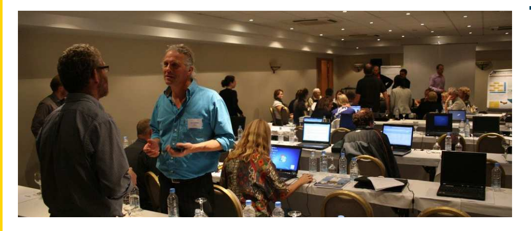
Lively discussions at the General Assembly, Malta, December 2010