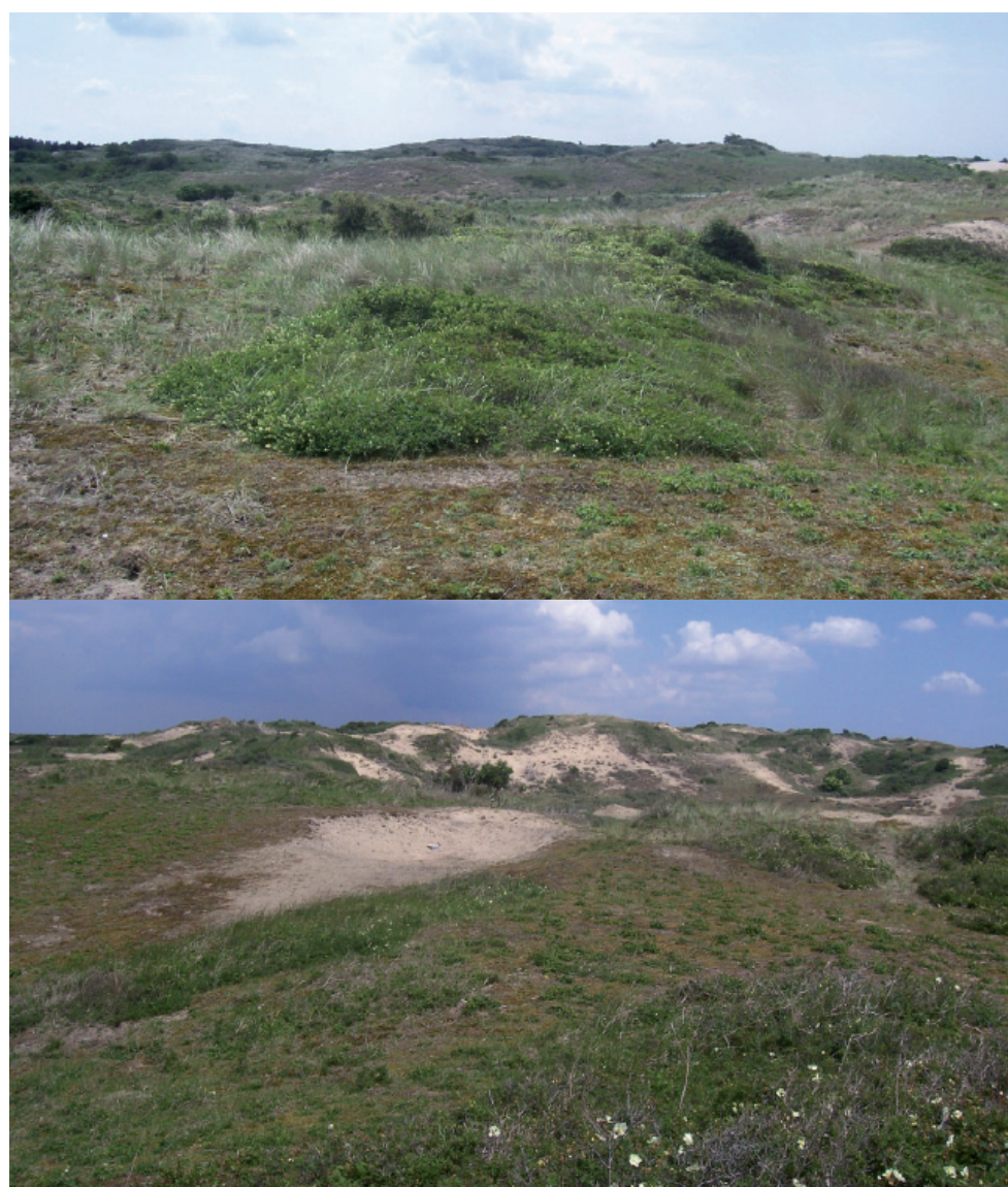
Figure 1. Soil cover on north (top) and south facing slopes in a dune area in the Netherlands.

Estimates of future freshwater availability are not reliable, as vegetation feedbacks to climate change are generally not accounted for in the computation of actual evapotranspiration ( ET_{act} ). An example of such a feedback is the increased water use efficiency, and thus reduced transpiration of plants due to increased atmospheric CO_2 concentration [1]. Here we focus on another vegetation feedback: the response of vegetation cover to increased drought [2] (Figure 1).