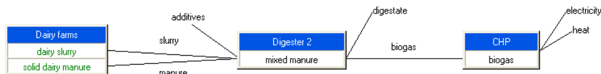
Figure 3.1 Structure of the "Nij Bosma Zathe" case in the Biolooco editor

Wageningen UR Livestock Research investigates the possibilities of anaerobic digesting of manure and the effects on the environment for the agricultural practice (Biewenga et al. 2009). At the Centre for the Dairy Farming Research at Nij Bosma Zathe the anaerobic digester is used for carrying out detailed research into gas yields of cow manure and maize and mineral composition of the ingoing and outgoing streams. The set-up of the installation is very suitable for comparative research. Future research is aimed at co-digestion of farm crops, excess grass of nature reserves and the use of a fuel cell to produce more electricity per unit biogas.