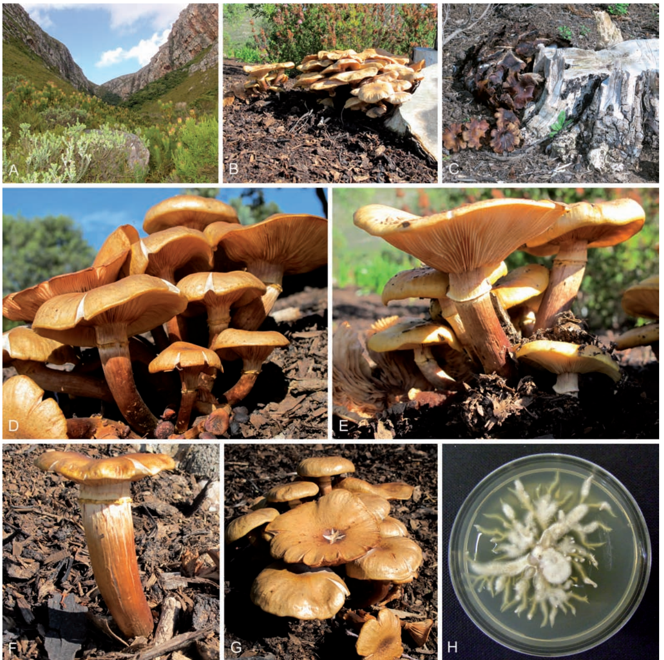
Fig. 1. Armillaria root rot in Kirstenbosch Botanical Gardens. A. Native woody shrubs and forest deeper in the valleys common on the Cape Peninsula. B, C. Clusters of fruiting bodies found on a stump. D–G. Robust fruiting bodies of Armillaria sp. showing a yellow cap, prominent annulus and stipe tapering down to the base. H. Rhizomorphs produced in culture.

of Kirstenbosch Botanical Gardens and close to Rycroft's Gate. These sporocarps could be physically linked to the roots of unidentified dead trees and Protea spp. (Fig. 1B, C). Upon removal of the bark from the dead roots, sheets of white mycelium typical of Armillaria root rot were found. The aim of this study was to identify the Armillaria sp. found fruiting in Kirstenbosch using data that were not available at the time of the discovery of Armillaria root rot in Cape Town (Coetzee et al. 2003b).