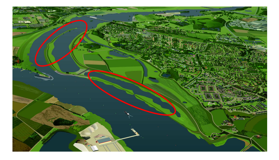
Figure 1 – Example of hydraulic structures in the Room for the River project "Hondsbroeksche Pleij"

Hydraulic structures are present in the designs of several Room for the River projects in the Netherlands. Examples are longitudinal weirs, groynes, summer dikes and weirs in the inlet of a side channel. Two-dimensional morphological simulations are frequently carried out to investigate the effect of such projects on for example hindrance for shipping and dredging costs. It is important that the physical processes around such hydraulic structures are correctly modelled in these situations.