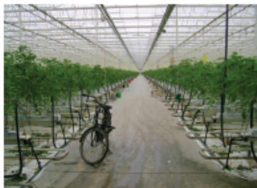
(Fig. 3b) Large-scale greenhouse trial with 20,000 tomato plants.

information about the type of damage and may be used to discriminate between damage as a result of regular crop operations and damage from diseases or pests.”