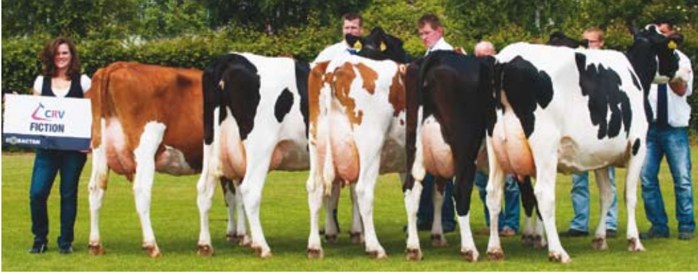
Fiction: his daughter group demonstrated that they are great producers