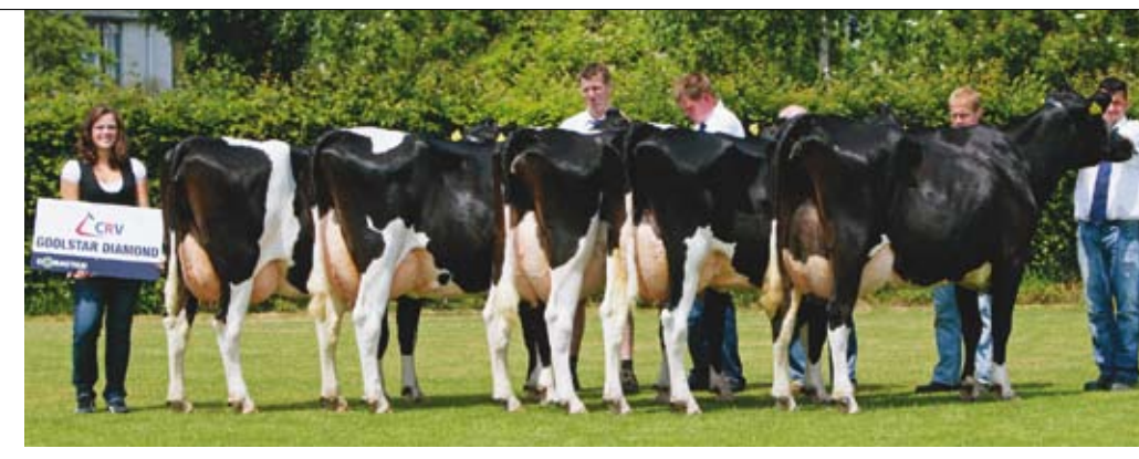
Goolstar Diamond: his second calvers made a sharp impression showing great dairyness

(+417days). Diamond distinguishes himself with good plusses for contents, +21kg, +0.15% of fat and +15kg, +0.09% of protein and a PLI of £161, very good type with 108