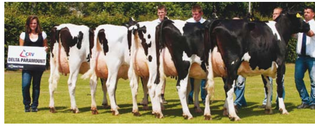
Delta Paramount: the uniform, nicely balanced group effortlessly paraded around the ring

udder and 106 legs, high udder health (107) and calving ease (107). The O Man son Fiction, from a Ronald dam, was represented by a first-crop daughter group demonstrating that they are great producers (+401kg of milk, 30kg fat and protein, £143 PLI). He showed a group of strong and robust 'producers' cows' full of character. He is a perfect partner for cows that need improvement for too high pins. Another point of interest is that Fiction also has the red factor.