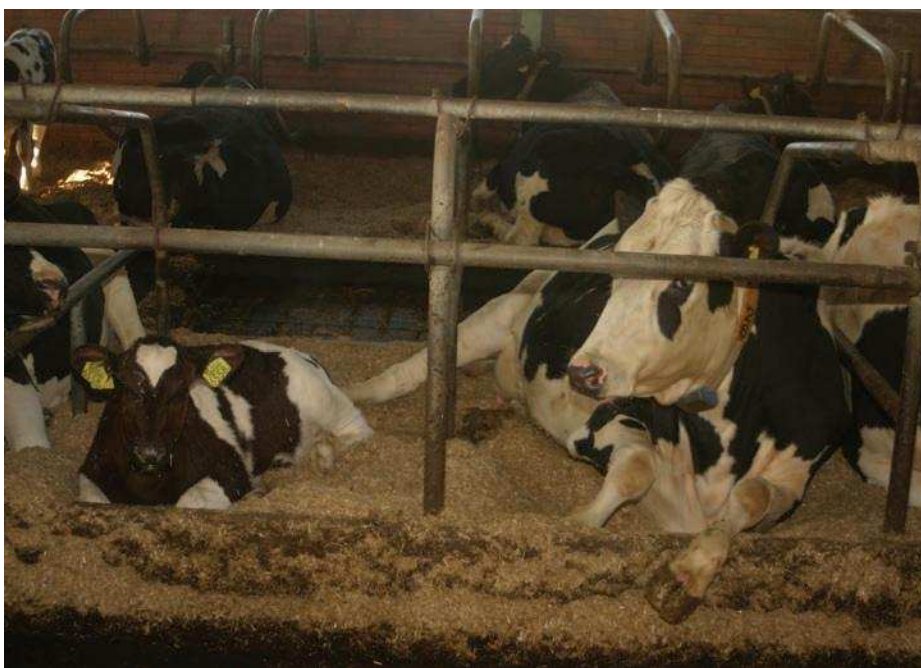
Photo 1. Single suckling was successfully implemented in existing housing facilities.

Both farmers initially started with a system of single suckling of the mother with additional machine milking. However, they experienced that calves moving around freely in the dairy herd led to practical problems. The most important problems were increased activity (unrest) in the herd due to the presence of calves and the separation of cow and calf during machine milking, which prevented cows from letting down their milk. Poor milk letdown was associated with a loss of marketable milk and an increased risk of problems with udder health. The farmers also were critical of the ad libitum milk consumption of calves and calves suckling other cows (aunties), both resulting in less marketable milk. While some of these problems could be partly solved, the farmers could not find complete solutions. After consultation with involved researchers, the farmers moved towards multiple suckling of nurse cows without machine milking. Multiple suckling requires housing space outside the herd, where one to three cows can nurse three to eight calves. Putting more cows and calves together in one group resulted in poor oversight and poor hygienic conditions. Because housing space was limited and expensive, the farmers started to aim for a calving peak in spring - early summer. In this way they could keep nurse cows and calves in an outside paddock, thereby reducing space requirements and also improving hygienic conditions.