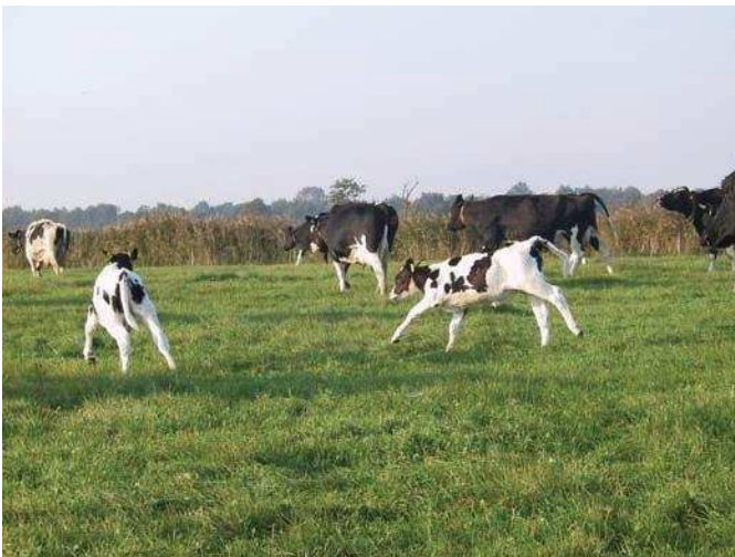
Photo 2. Suckling system during pasturing: added value!

We would like to thank the farmers who participated in our research and for the funding provided by the Triodos Bank, the Province of North-Holland, and the Dutch Ministry of Agriculture, Nature and Food quality, the Integrated Project QUALITYLOWINPUTFOOD, FP6-FOOD-CT-2003- 506358 by the European Community under the Sixth Framework Programme for Research, Technological Development and Demonstration Activities.