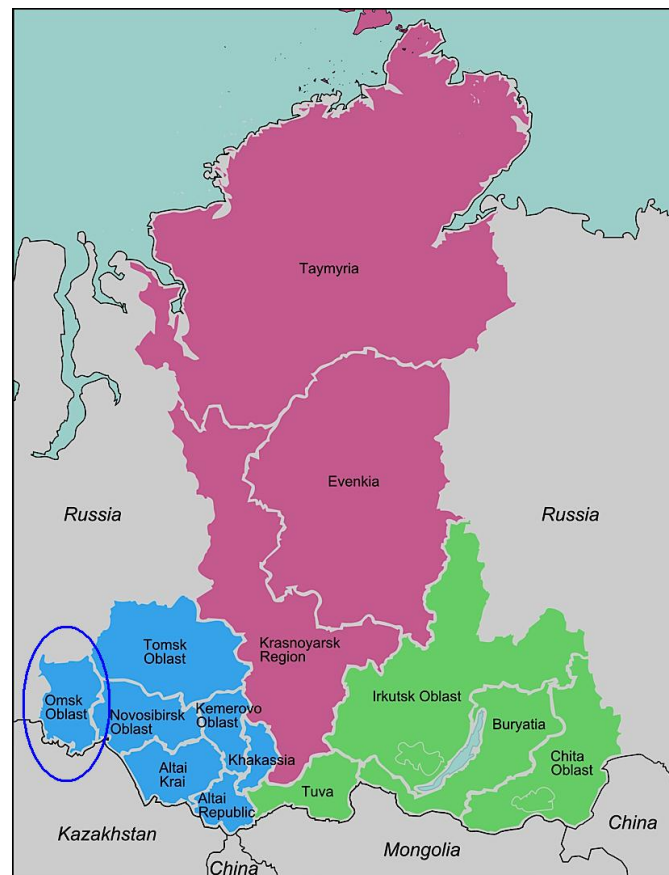
Fig. 1. Map of Russian Siberia with Omsk Oblast highlighted (Source: http://iguide.travel/illustrations/Siberia-2.png ).

Biofuel initiatives in Omsk Oblast rely on the regional agriculture potential, which, despite the adverse inland climate (cold and snowy winters with an average temperature of -19^{\circ}\text{C} , and warm and dry summers with an average of +19^{\circ}\text{C} ), plays an important role in the regional economy. The local companies and entrepreneurs intended to use wheat, rapeseed, and sunflower seed from the region as a source for liquid biofuel production. Regional demand in these major agricultural products is covered by regional production. The gross production of grains including wheat in the recent years was about 3 million tonnes and was partly exported to the nearby regions and Kazakhstan. The area for rapeseed increased from 5 thousand hectares in 2005 to 35 thousand hectares in 2007, further contributing to regional overproduction (Information Portal of Omsk Oblast, 2008).