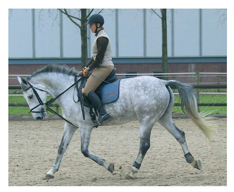
Figure 3. A horse ridden "rollkür" (round and deep with a draw rein) in the study of Sloet van Oldruitenborgh-Oosterbaan et al. (2006)

shows that the treatment resembled a posture in which the horses were ridden with the nose behind the vertical (comparable to HNP3 in Figure 2), but not with the chin onto the chest. Riders were not blind to the treatment and half of the horses started with a test in LDR, the other half of the horses in a test with a natural posture (comparable to HNP1 in Figure 2), with only light rein contact. During the tests horses were trotted and cantered for several minutes.