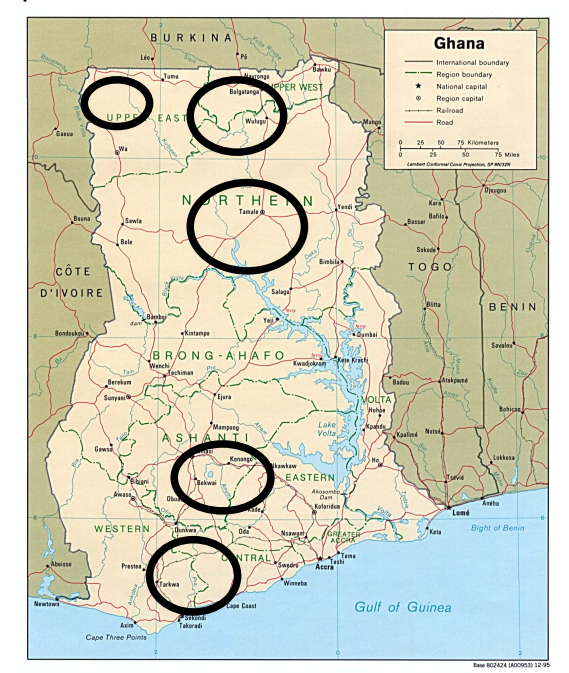
Box 3; Map of Ghana indicating the communities where the study was conducted

Although the study was restricted to Ghana, it is assumed that the results are largely valid for West Africa as a whole or even all of sub-Saharan Africa, since the five chosen locations represent the predominant climatic systems of Africa.