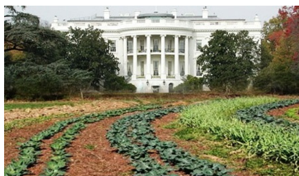
With the hands in soil (hoe, hoe, hoe) following the adagiums: Garden to cut food costs and Plant a Victory Garden.

offer their opinions on policy, others will.’ As a result, soil legislation is slowly but steadily developing in many countries and also at the EU level. Soils have entered the policy arena.