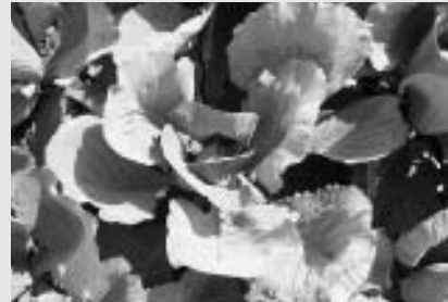
Picture B – Variety B shows a red cabbage type with no clear difference between the outer, less weed-suppressive leaves and inner leaves, all being more or less erectophile from the

vegetative, mass building and ripening processes that they can attain optimal ripening qualities. He found that plant types with a clear distinction between the vegetative development in the juvenile phase and the reproductive development after booting could best attain the ripening quality, which he could more easily find among taller wheat types than among the modern dwarf types. Such selection criteria result in plants with a longer peduncle with the ear ripening further above the wet leaf canopy in light and wind. This also results in an ecological advance of less pressure of ear diseases under organic conditions.