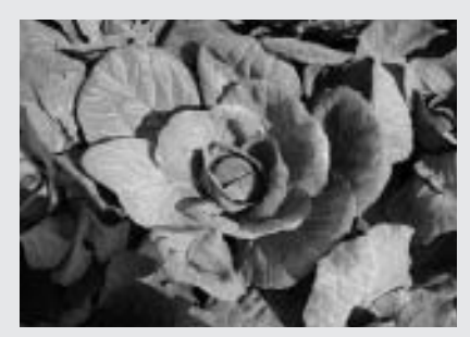
Picture A – Variety A shows a red cabbage type with a more outspoken difference between the outer, older, planophile leaves with a strong weed-suppressive ability and the inner, younger erectophile leaves.

Next to the observations of quantitative traits (plant height, mass, dry weight, disease infection, etc.) as important aspects of selection or assessing the breeding progress, breeders usually also perceive and assess the total impression of plants, and that can be seen as an aspect of the integrity of plants. Breeders develop such a way of perceiving on the basis of a personal relationship with their plant object, based on their former and recent experiences and observations of plant performances in the field. Perceiving a specific kind of 'wholeness' indicates that plants are more than the sum of isolated characteristics that can be registered by computers. The appreciation of the perception of wholeness of a plant depends on the breeder's individualised inner view of plants and on a personal, basic attitude towards nature. It comprises more than merely aesthetic characteristics or agronomic value. It can lead to extra parameters on the basis of experiential knowledge. These extra parameters may be related to the spread in quality, disease tolerance, etc. It has to do with what breeders call 'the breeder's eye' after years of personal dedication to and relationship with his breeding object/crop, constantly comparing