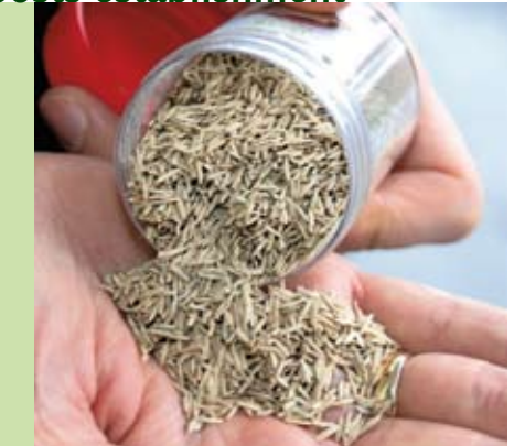
Coated grass seeds

This autumn just two treated seed mixtures are available from the company. One is a general reseeding mixture and the other is ideal for over seeding. The